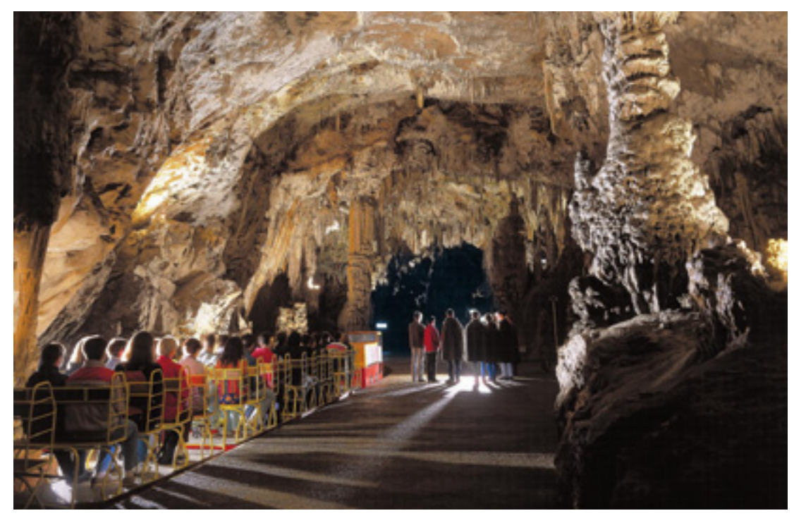
The most popular tourist attraction is the Postojna Cave, annually visited by more than half a million people.

In the previous 15 years, the Slovenian tourist industry has registered above-average growth; the number of foreign tourists has increased by 160%.