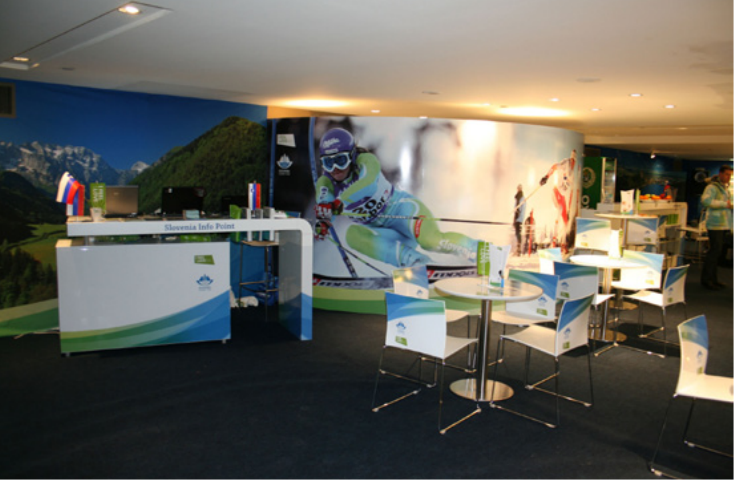
Originally, the brand "I feel Slovenia" was primarily used in tourism. However, after 2010, it was also included in major sport events, such as the Winter Olympics, the Football World Cup and the Basketball World Championship.