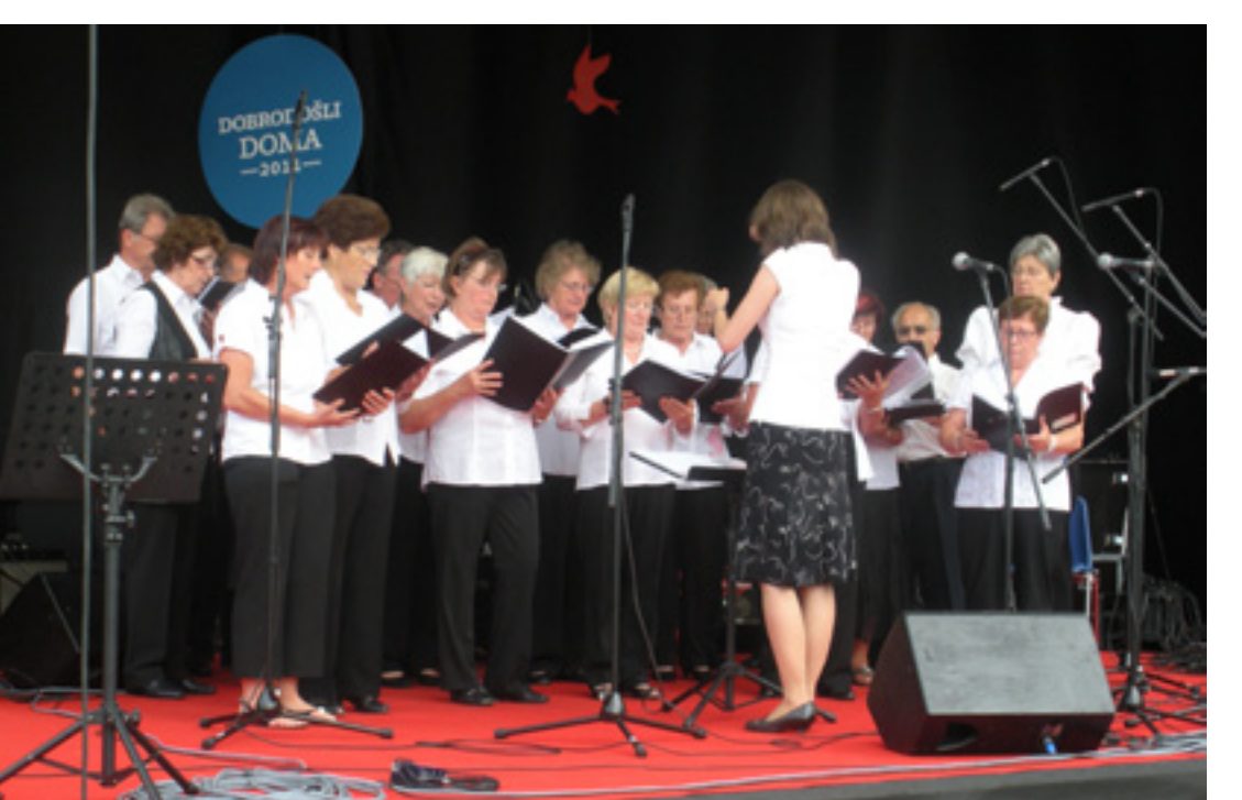
Government Communication Office

With regard to the demanding living and working conditions of many Slovenian emigrants, especially the more recent generations, it is clear that to maintain national identity in