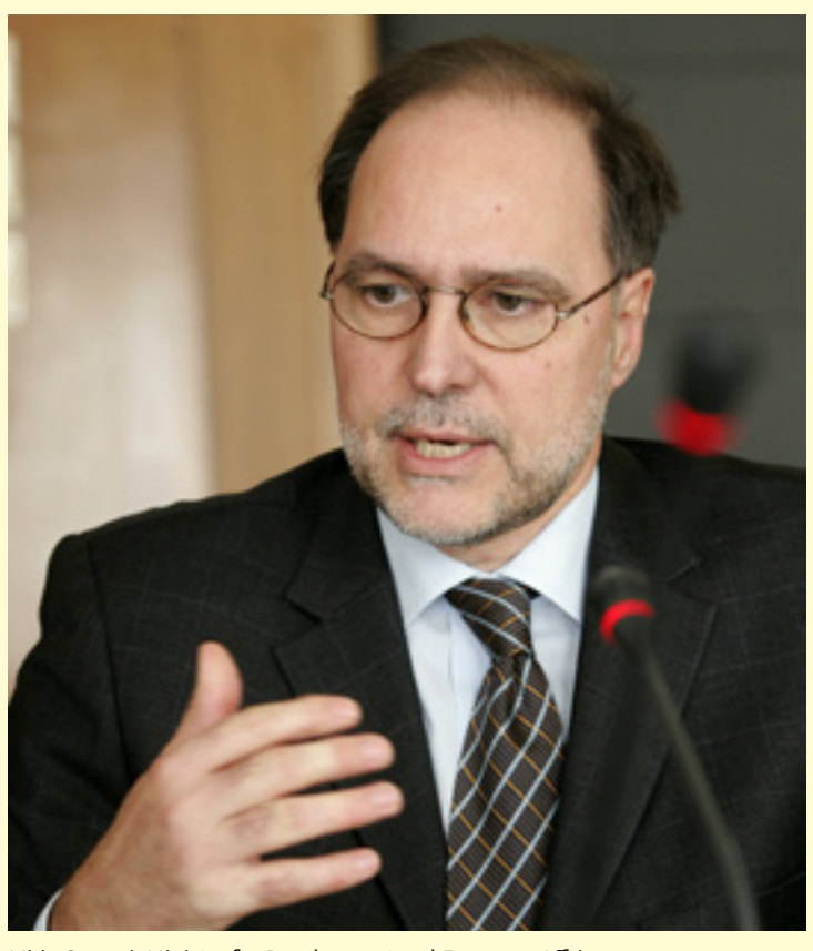
Mitja Gaspari, Minister for Development and European Affairs.

when negotiations on the reconstruction of the railway infrastructure are concluded, when this eventually happens. Construction companies built many luxurious housing units which are selling very slowly, and thus, their money has been built into the units.