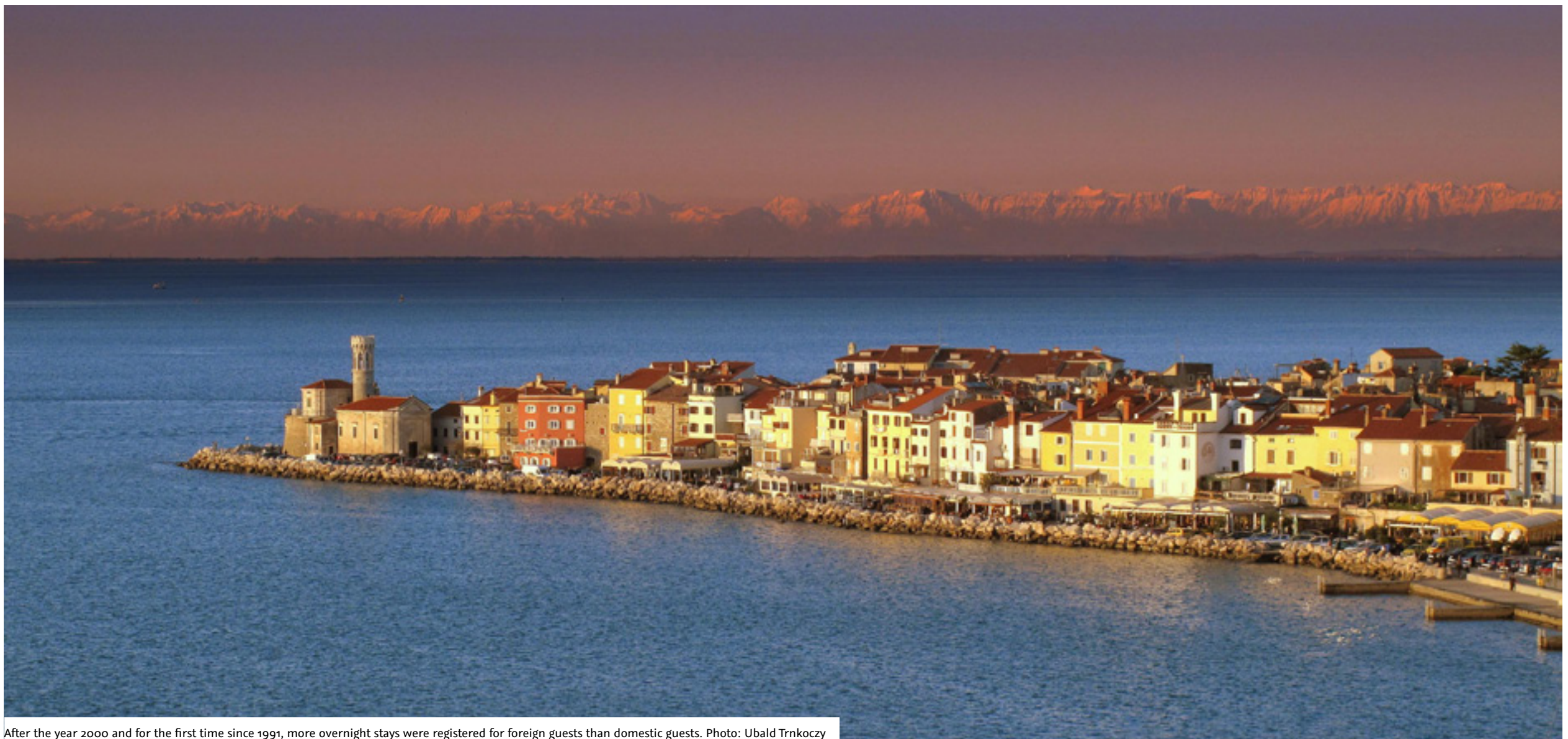
After the year 2000 and for the first time since 1991, more overnight stays were registered for foreign guests than domestic guests.

of the 1990s, the number of foreign guests was still lower by one third in comparison with the year before the independence. There was also a rapid decrease in the number of tourists from the former Yugoslavia. In 1990, Slovenia was visited by 800,000 guests from the other Yugoslav republics, but three years later (1993), this number was only 50,000.