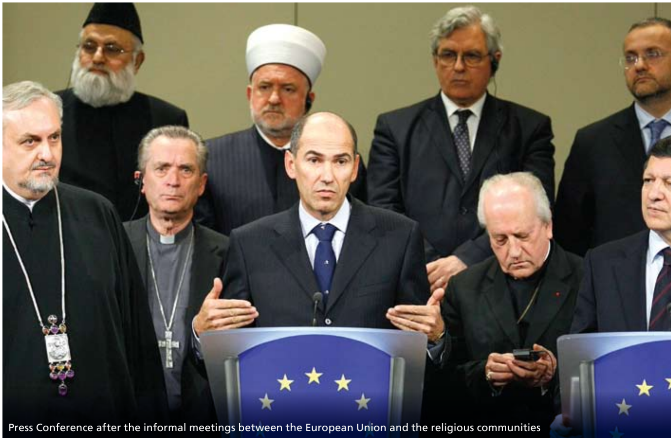
Press Conference after the informal meetings between the European Union and the religious communities

Text: RAMON MIKLUS