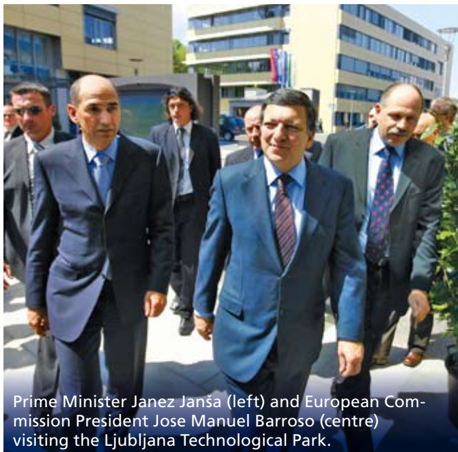
Prime Minister Janez Janša (left) and European Commission President Jose Manuel Barroso (centre) visiting the Ljubljana Technological Park.