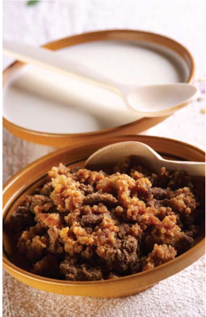
Buckwheat dumplings must be small and the milk must be thick.

Nettle soup, the best portion of vitamin C, many times finds its way to the table in the spring. Guests also praise the homemade žlikrofi, dough 'pockets' with various fillings. Veal stew is excellent, accompanied by buckwheat dumplings, an unavoidable Slovenian side dish. In addition, the lady of the house always makes rich homemade breakfasts and dinners with diverse homemade recipes. If you stay for a few days, you will be offered half-board, because they do not make lunch. But if you drop by at noon, you will surely find something. Most certainly, Alpine pie, which could not be named differently when coming in a package with such a panorama of mountains. A bit of dough for the shape and lots of cottage cheese filling, with a touch of homegrown fruit - apples or bilberries, raspberries, cherries, and other things nature brings. Nobody can resist this sweet temptation, so simple, natural and