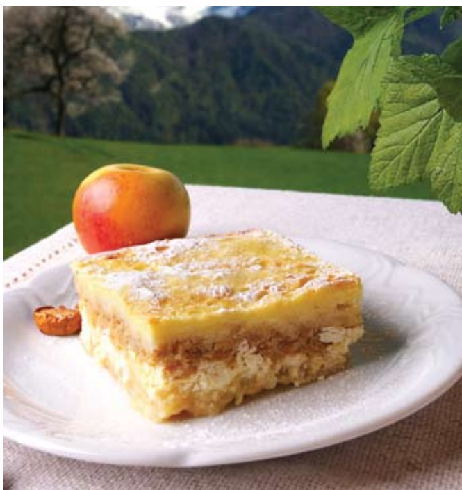
Alpine pie with apples.

juicy. Visitors also praise Žibovt's homemade jam, and this is why it pays to spend a night here and try jam for breakfast. It's not that you wouldn't be offered it otherwise, if you ask for it.