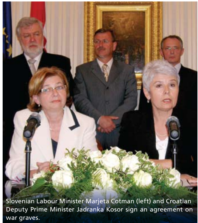
Slovenian Labour Minister Marjeta Cotman (left) and Croatian Deputy Prime Minister Jadranka Kosor sign an agreement on war graves.

Labour, Family and Social Affairs Minister Marjeta Cotman and Croatian Minister of Families, Veterans' Affairs and Intergenerational Solidarity Jadranka Kosor signed on 12 May a reciprocal agreement on war graves. "We have added a piece into the mosaic called historical truth," said Kosor. The document outlines how mass graves of victims of both world wars and the killings that followed will be marked and managed. "We pledge to mark the graves on both the Slovenian and Croatian sides in accordance with international law, in order to pay respect and devotion to the dead," Cotman said. The graves will be marked by special signs, and a monument in the shape of a charnel house for soldiers and civilians alike will be erected in the Tezno forest near Maribor, Cotman explained. The remains of some 15,000 mostly Croatian victims of post-war killings are thought to lie in a former anti-tank ditch in the forest there. The agreement applies to around 500 mass grave sites in Slovenia. "So far, we've discovered 110,000 bodies, but excavations and probes are still ongoing," Cotman said. She also announced the formation of an intergovernmental commission which will oversee the implementation of the agreement. Slovenia and Croatia will appoint three commission members each.