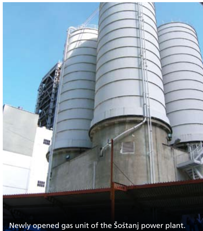
Newly opened gas unit of the Šoštanj power plant.

The Šoštanj coal-fired power plant connected its first gas unit to the power grid on 9 May, a 42-megawatt (MW) project that will improve the environmental footprint of Slovenia's largest power plant. Economy Minister Andrej Vizjak and Health Minister Zofija Mazej Kukovič applauded the achievement. Vizjak said that the gas unit would boost the output of the fifth reactor of the plant. It will