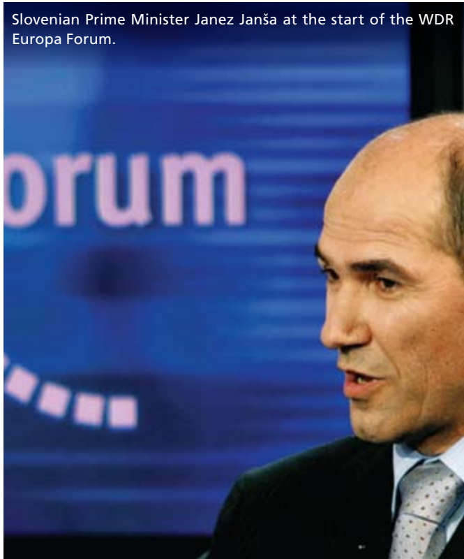
Slovenian Prime Minister Janez Janša at the start of the WDR Europa Forum.