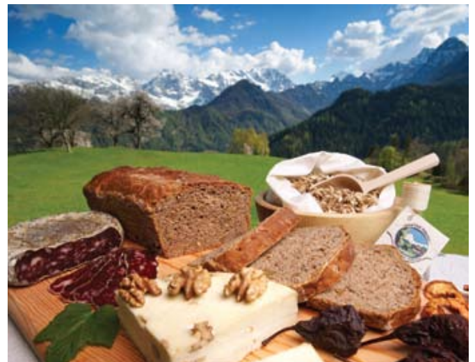
A view of the Savinja Alps over Savinja želodec, cheese and home-dried pears.

is still organic and homemade as always, which is rarely the case with this Slovenian shepherd's and farmer's meal. You cannot even make it from commercial milk, as it becomes bitter rather than sour. The right sour milk is hard as pudding, it shivers slightly in a bowl, can be »cut« with a spoon and is covered with a thin layer of sour cream. Ordering buttered homemade buckwheat dumplings, or square homemade buckwheat bread with walnuts together with sour milk is a must, and both worth the sin. But this happens hopelessly rarely nowadays. You will frequently stop eating to observe the charming range of the Savinja Alps, as the peaks of Raduha, Ojstrica, Planjava, Brana, Turska gora, Skuta,