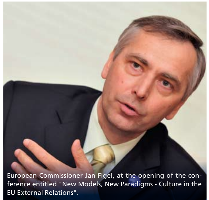
European Commissioner Jan Figel, at the opening of the conference entitled "New Models, New Paradigms - Culture in the EU External Relations".

Culture and intercultural dialogue must play a bigger role in the external relations of the EU, as they are crucial for cooperation and mutual understanding, EU Commissioner Jan Figel' said at the opening of a two-day international conference in Ljubljana on 13 May. The EU promotes cooperation among institutions and artists from different countries and different cultural backgrounds, Slovenian Foreign Minister Dimitrij Rupel said at the opening of the conference, entitled »New Models, New Paradigms – Culture in the EU External Relations«. According to Rupel, EU foreign policies promote intercultural dialogue wherever it is necessary and possible: in the Western Balkans, the Middle East, the Caucasus, and others, while Slovenia has set intercultural dialogue as one of its priorities for its EU Presidency. But there is still much to be