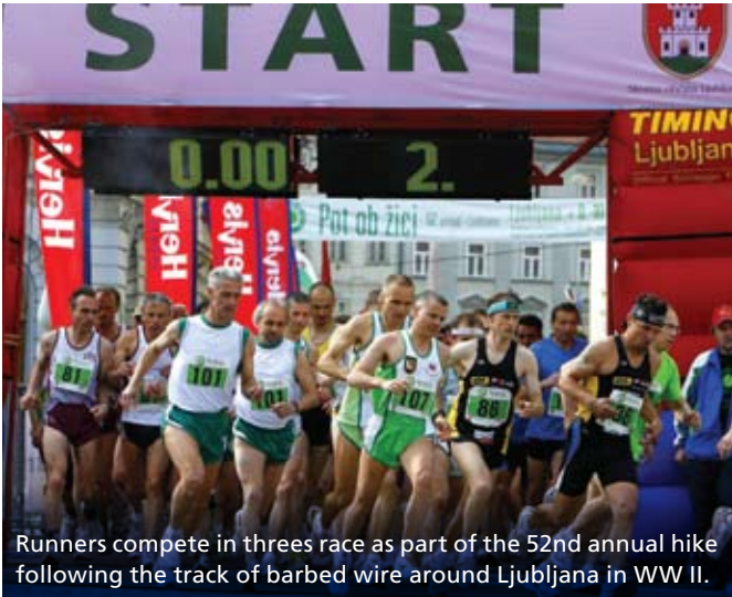
Runners compete in triathlon race as part of the 52nd annual hike following the track of barbed wire around Ljubljana in WW II.

who would like to see the hospital reconstructed so it will again symbolise humanitarianism, solidarity and honour, which were demonstrated in the resistance and got their most obvious manifestation in Franja. "That is why it needs to be preserved for future generations," Türk said.