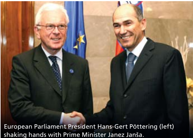
European Parliament President Hans-Gert Pöttering (left) shaking hands with Prime Minister Janez Janša.

Prime Minister Janez Janša and European Parliament President Hans-Gert Pöttering discussed topical issues on Europe's agenda during Slovenia's stint at the helm of the EU, as they met in Ljubljana on 13 May. Janša presented to Pöttering the presidency's preparations for the June EU Summit, while Pöttering assessed Slovenia's term so far as positive. Pöttering said the meeting had been very fruitful and touched on numerous key topics that are to be discussed at the summit. These included ratification of the Lisbon Treaty and cooperation between institutions, which is necessary for preparing new mechanisms envisaged in the treaty. Pöttering emphasised the importance of the presidency's initiatives aimed at strengthening intercultural dialogue, especially in the framework of the Euro-Mediterranean Partnership (EuroMed). The pair also talked about the EU-Latin America Summit (EU-LAC), which was to take place that week in the Peruvian capital, Lima. According to the European Parliament's Information Office in Slovenia, Pöttering welcomed Slovenian efforts for launching talks on a new strategic partnership between the EU and Russia. He underlined the need to find a solution that would allow the EU to bolster its ties with Russia and at the same time consider Lithuania's energy needs.