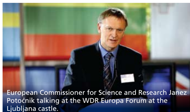
European Commissioner for Science and Research Janez Potočnik talking at the WDR Europa Forum at the Ljubljana castle.

European Science and Research Commissioner Janez Potočnik on 9 May called for greater cooperation at the EU level as the bloc endeavours to tackle global challenges and create a knowledge-based society. "One plus one equals more than two in a society of cooperation," Potočnik said in his address to the Europa Forum in