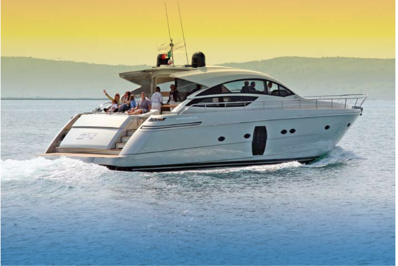
New Luxury Yacht Pershing 64