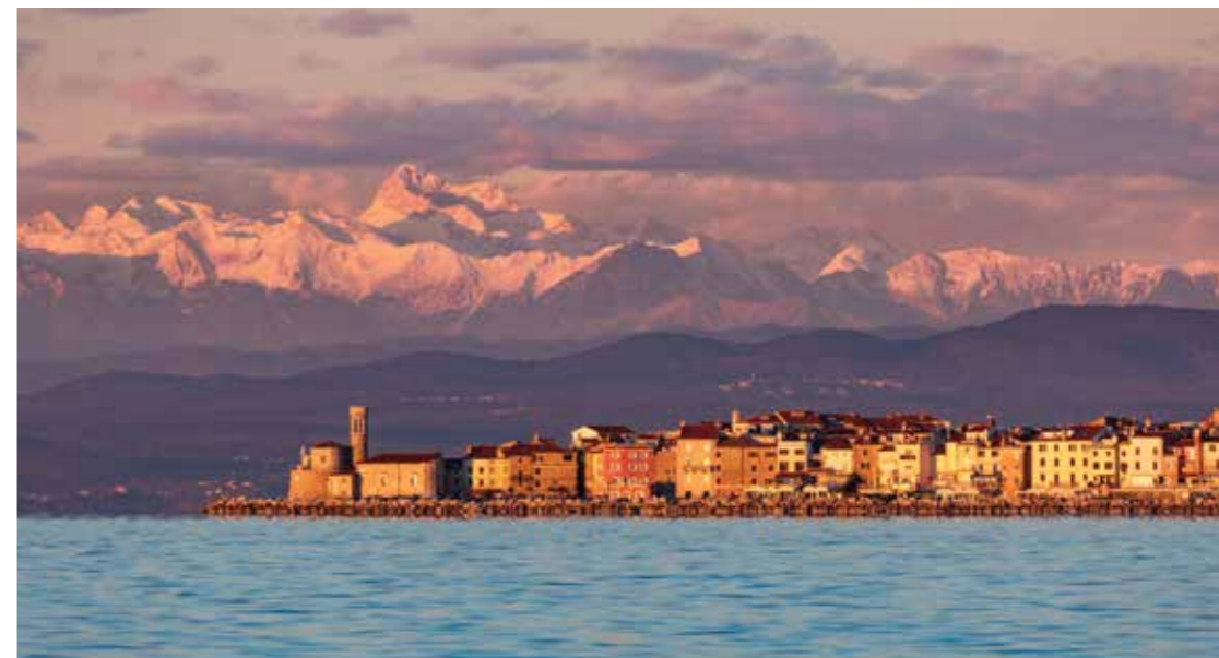
When is cloudless, a view of the Julian Alps with Triglav can be seen above Piran, which is approximately 100 km away from Piran.

If you just give Slovenia a chance, you will realise that special, surprising and delightful experiences await around every corner. Explore, discover, enjoy – Slovenia is sure to enchant you.