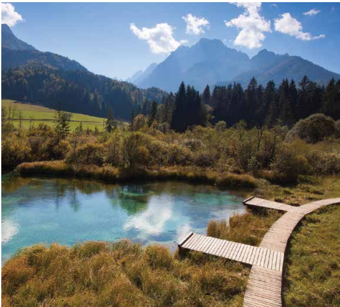
Zelenci natural reserve.

History has also left its mark on Dolenjska and Bela krajina.