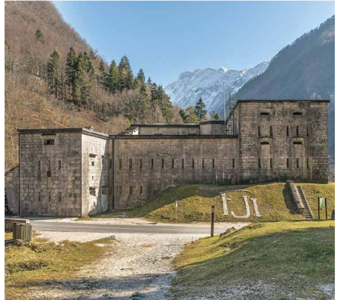
This majestic fort Kluže above the Koritnica gorge is one of the most visited cultural sights in the Soča valley. It is an important monument to the defence against Turkish invasions, Napoleon's army and attacks during World War I.

Brda is rich in cultural landmarks, including the Gonjače lookout tower, the Renaissance Dobrovo Castle, the Church of Saint Cross, a hunting mansion of the Gorizia Counts, and the Mediterranean village of Šmartno. The beauty of the Brda hills has inspired countless artists over the years.