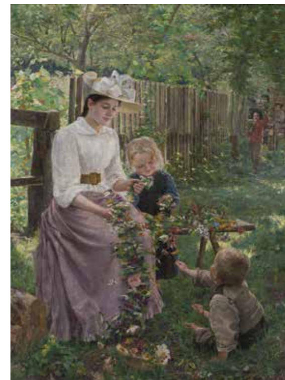
Ivana Kobilica, one of the most famous Slovenian painters, worked in the 19th century and laid the foundations of Slovenian painting. Her works are recognised for their realistic depiction of motifs, often involving nature and everyday life.