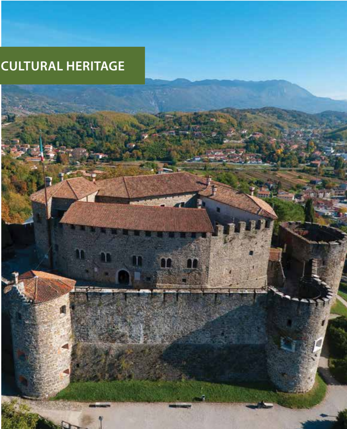
Gorizia Castle.