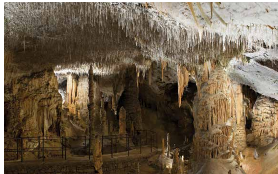
A magic corner of the Karst world - Postojna Cave.