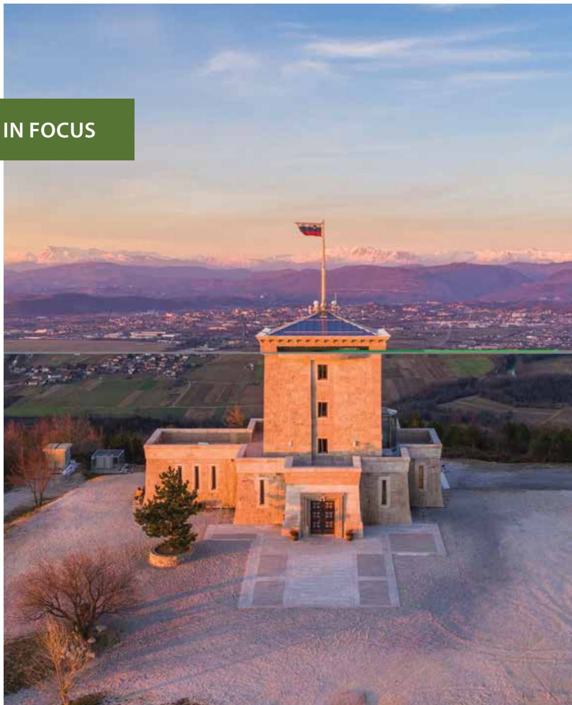
The Monument of Peace at Cerje, located in the Kras region, offers a panoramic view from the Alps to the Adriatic.