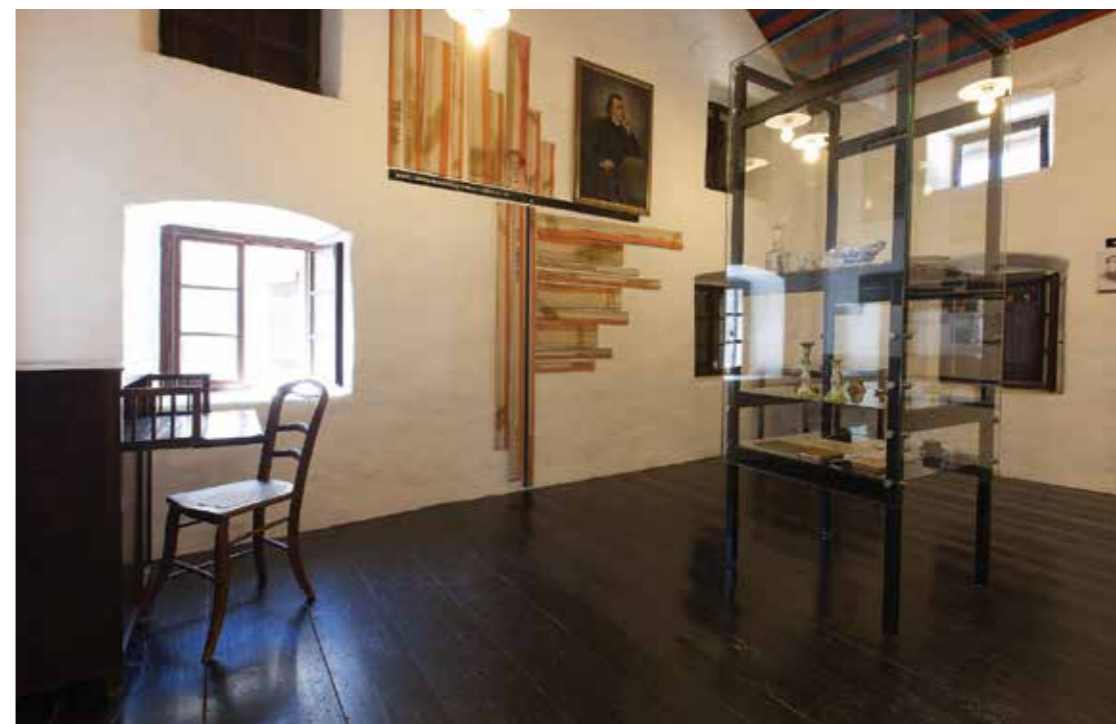
Simon Gregorčič's birthplace in the village of Vrsno.

You are splendid, limpid daughter of the heights, You are graceful in your natural beauty, When your transparent depths, Are not disturbed by the wrath of darksome storms, You are splendid, limpid daughter of the heights!