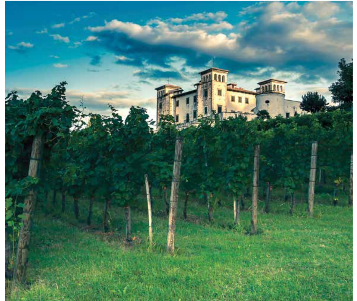
A Renaissance masterpiece, Dobrovo Castle is fortified with walls and two oval towers. Today, it houses a prestigious restaurant and wine cellar.