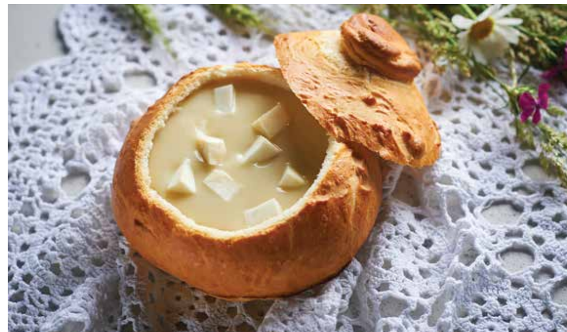
Šelinka is minestrone-style soup made of celery and celeriac, vegetables, spices and pork.