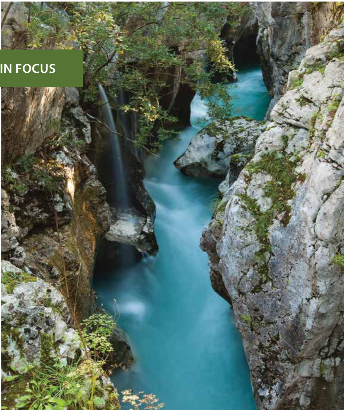
The Soča River, one of Europe's most beautiful rivers, originates below Jalovec in Trenta and flows into the Adriatic Sea. Its distinctive emerald green colour is due to its limestone riverbed and the pristine, mineral-rich water that shimmers brilliantly in the sunlight.