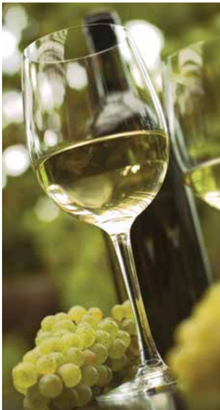
Among white wines, Malvasia is characteristic of the Gorizia region.