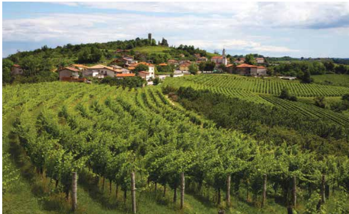
Vineyards in village Šmartno, Goriška Brda.

Visitors can indulge in homemade meats, cheeses, olive oils and traditional desserts such as briška gibanica (a layered strudel-like cake). A leisurely stroll through the medieval village