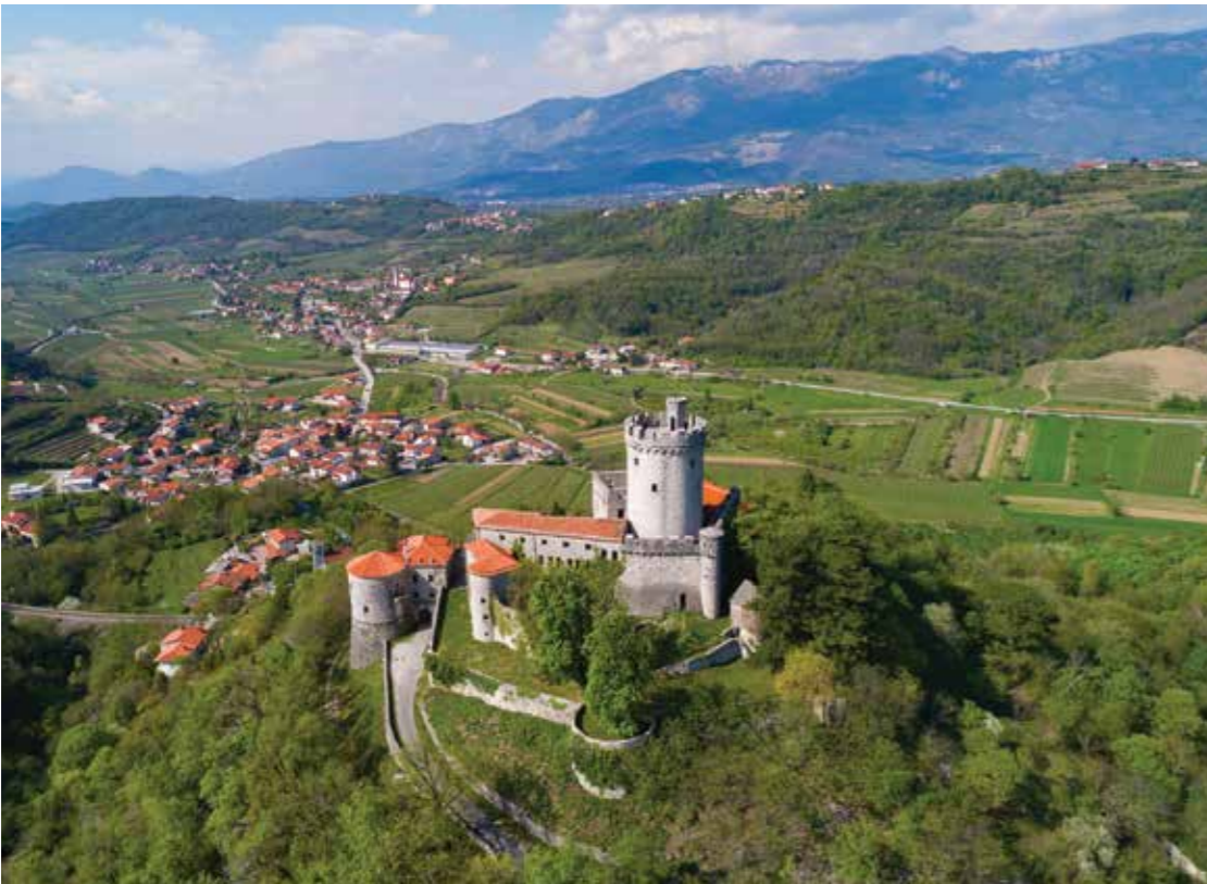
Rihemberk Castle.

Although some brave knights are said to have fought and defeated the dragon, the treasure was never found. According to locals, at night, you can still hear the rustling of the dragon's wings within the castle walls.