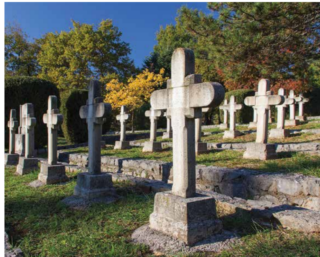
Military cemeteries are solemn reminders of the tragedies of war and its lasting impact on both people and landscapes.

Adding a literary dimension to the trail, part of the Ernest Hemingway's novel A Farewell to Arms is set on the Isonzo Front. The novel vividly describes the experiences of Henry Frederic, a military captain fighting for the Italian army near Kobarid.