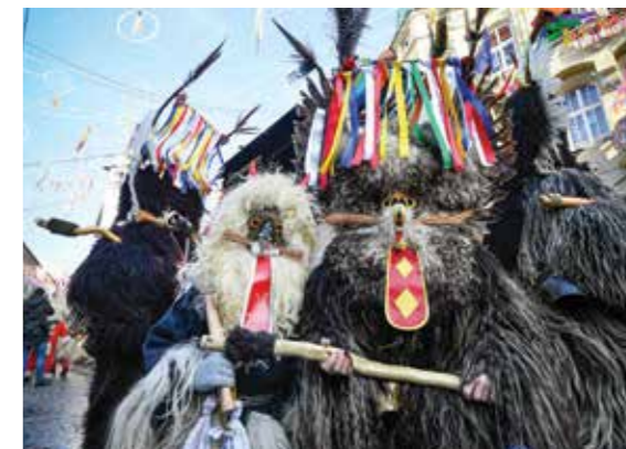
Kurent is a carnival traditional character. He chases away everything bad and brings fortune and happiness.

The coast, with its Venetian-inspired towns such as Piran and Koper, tells stories from the time when they were under Venetians rule. Each of these towns features unique landmarks, such as Tartini Square in Piran or the Praetorian Palace in Koper.