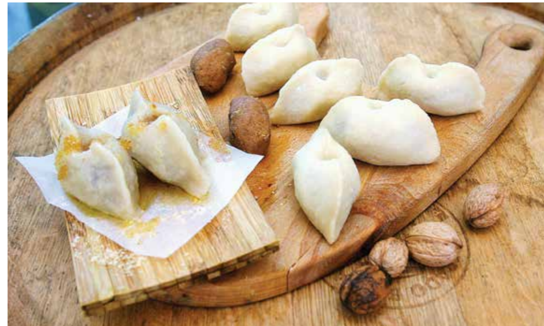
Kobarid dumplings.

Welcome to Goriška, where the Mediterranean meets the Alps, and where the past and future blend seamlessly into a land of unforgettable flavours and experiences, truly embodying the message of bringing people together.