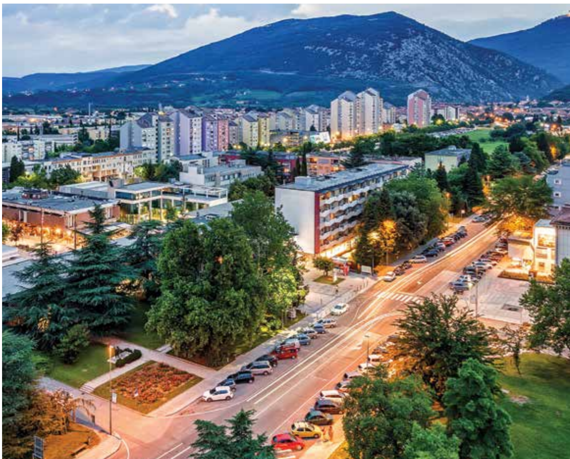
Nova Gorica is a fascinating example of architectural experimentation, combining modernism, functionality and harmony with nature. Its architecture reflects both the historical context of its creation and the enduring spirit of openness and cross-border integration that the city continues to uphold today.

The master plan for Nova Gorica, designed by the architect Edvard Ravnikar, is rooted in a grid system of streets and open spaces, fostering a sense of openness, transparency and greenery. Ravnikar, a student of the renowned Le Corbusier, incorporated modernist principles into the city's design, while thoughtfully adapting them to local cultural and practical needs.