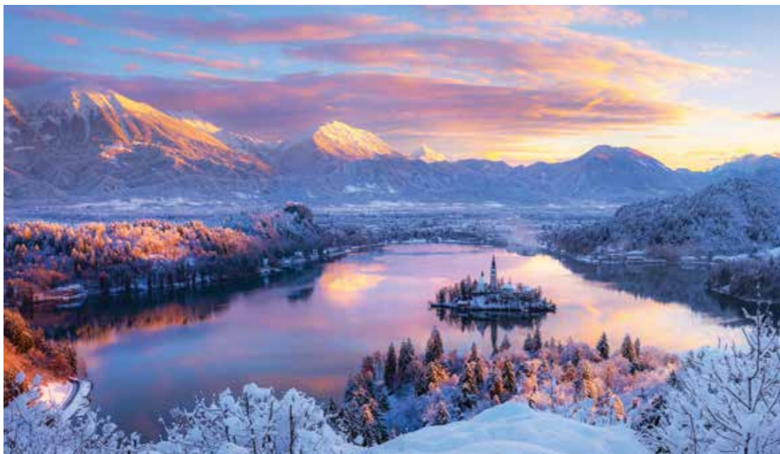
Lake Bled, with its islet and the Church of the Mother of God, is one of Slovenia's most recognisable symbols. In addition to its natural beauty, Bled offers many opportunities for recreation and relaxation.