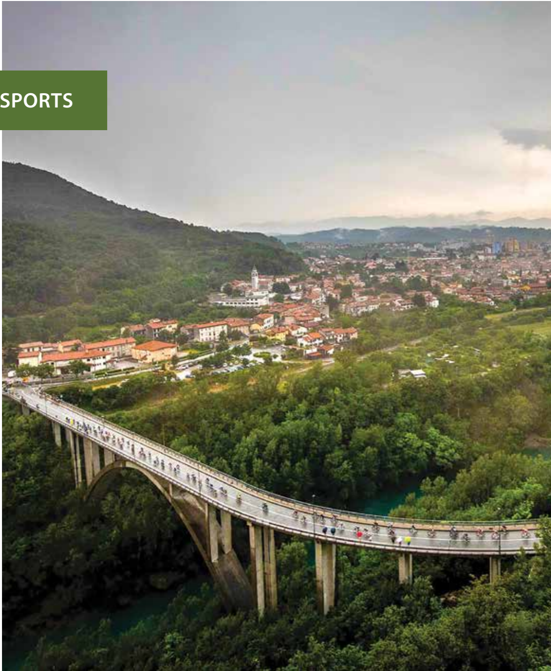
Solkan Bridge is the bridge with the biggest stone arch in the world. Take a bike and enjoy the view of this grand structure over the greenish-blue Soča River.