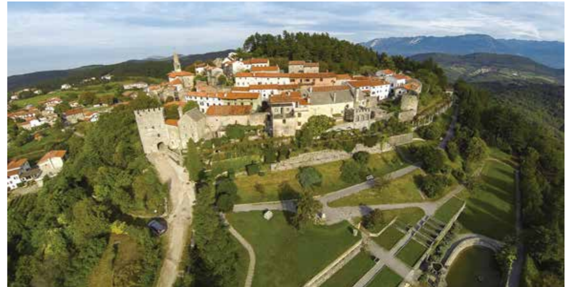
Štanjel Castle.