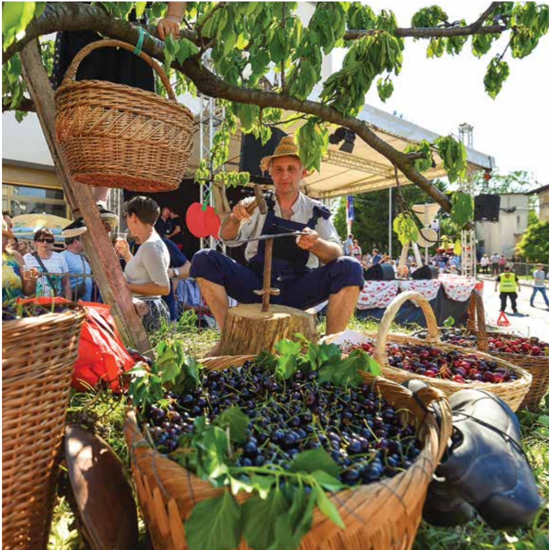
Famous for its living traditions, Goriška Brda comes alive every year with its famous Cherry Festival.

Rebula and Olive Oil Festival in Brda, the Soča Outdoor Festival, and many events in both Nova Gorica and Gorizia, which attract visitors from near and far. The region also offers a vibrant cultural scene with a rich programme of concerts, theatre performances and exhibitions.