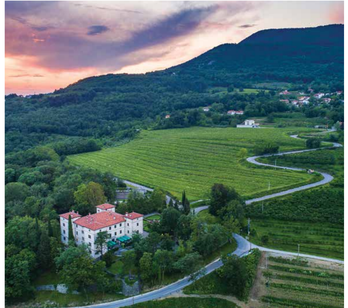
Kromberk Castle.

She appears to visitors who stay too long in the