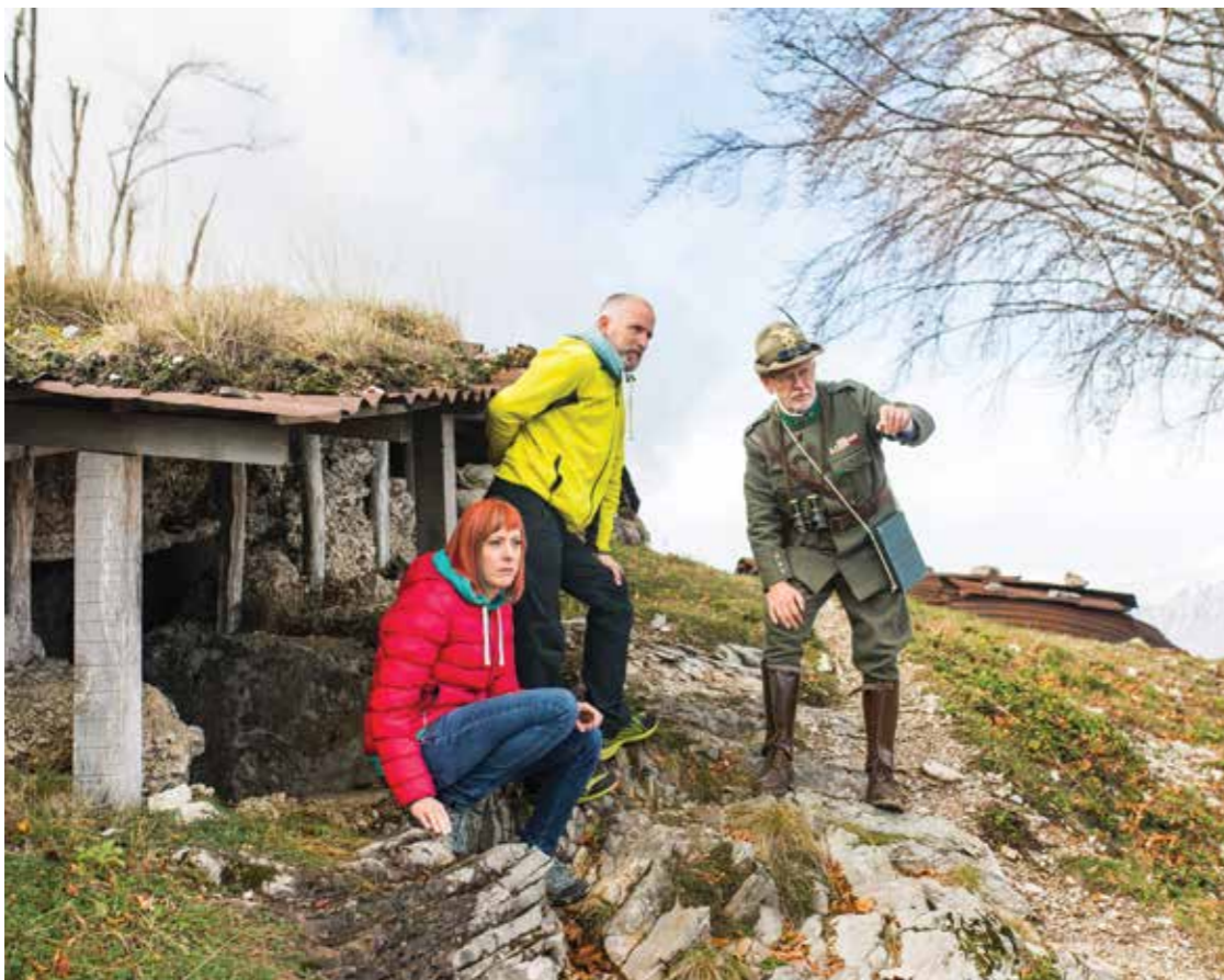
The route connects monuments, open-air museums and natural sites, all unified by a message of cooperation, friendship and peace.

tunnel built during World War I. Once one of the bloodiest battlefields on Slovenian soil, Mt Škabrijel now rewards visitors with breathtaking views of the Julian Alps, the Kras region and the Adriatic Sea. The Monument of Peace at Cerje, located in the Kras region, offers a panoramic view from the Alps to the Adriatic, a poignant reminder of the legacy of war and the importance of peace.