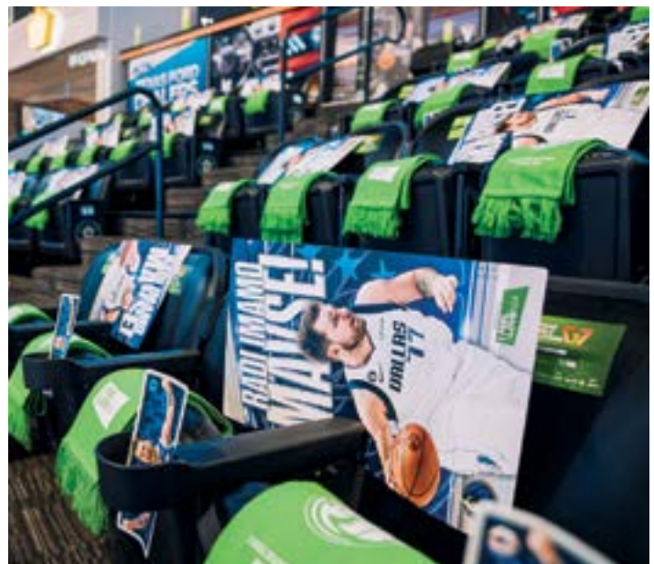
A scarf I Feel Slovenia for tha fans at the game.