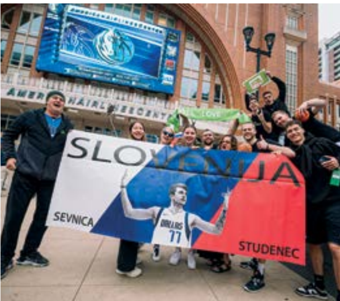
Fans from Sevnica, Slovenia.