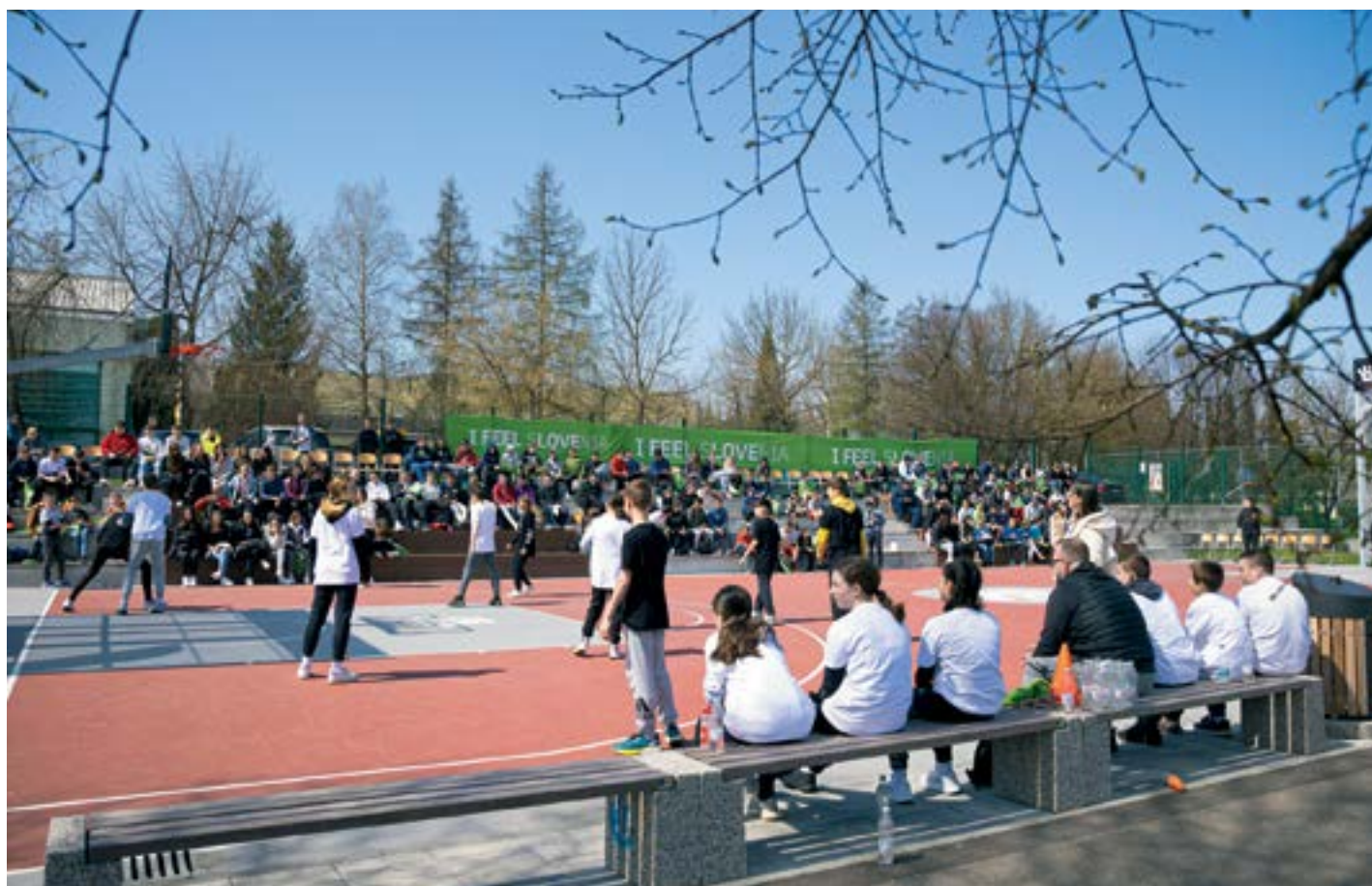
Young basketball players from the Žoltasti Troti Basketball Club and the Krka Women's Basketball Club.

Young basketball players from the Žoltasti Troti Basketball Club and the Krka Women's Basketball Club took part in the exhibition basketball match. They all won and thereby proved the importance of cooperation, the joy of sport and the spirit of sportsmanship. Dancers from the Novo mesto Dance Studio created a great atmosphere with their dance performance. The programme was followed by basketball games in which young visitors showed their skills and received 'I Feel Slovenia' products as prizes.