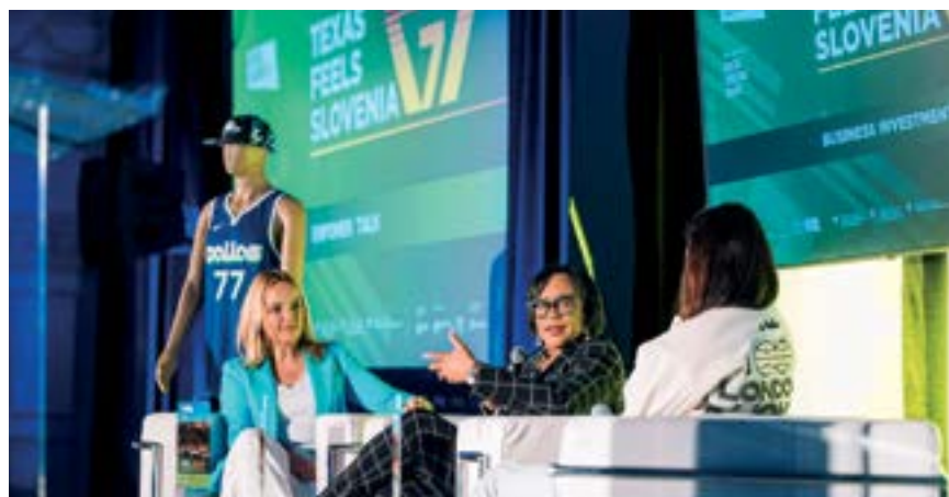
Business Investment Conference and the Slovenian Tourism Workshop - “Texas Feels Slovenia.”

The event was named “I Feel Slovenia Night” because Slovenia is represented at home and abroad by the I Feel Slovenia national brand, which is managed by UKOM. Therefore, the events in Dallas were also a promotion of Slovenia’s breakthrough solutions, Slovenia as a country of top sporting achievements, culture, art and Slovenia as a boutique tourist destination.