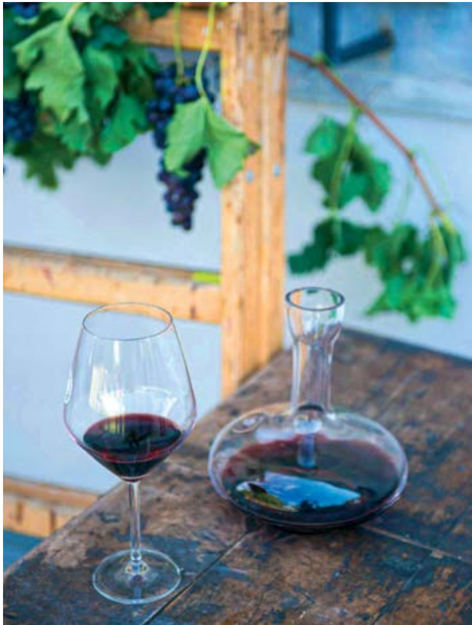
Teran's qualities can be admired in its intense ruby red colour, unique fruity aroma and fullness of flavour.

Another unique experience and an old secret of the Vipava and Karst regions are the so-called “osmice”, whose popularity has been constantly increasing among the locals and the visitors since the times of Maria Theresa when they were first introduced. In the 18th century, winegrowers and farmers were granted an 8-day licence (“osmica” means “the eight”) to sell their homemade beverages and other local delicacies tax-free. Today, these osmica events are held twice a year on every farm. They can be recognised by an ivy branch hung on the farmhouse or on signs placed along the routes leading to the farmhouse hosting an osmica from nearby towns.