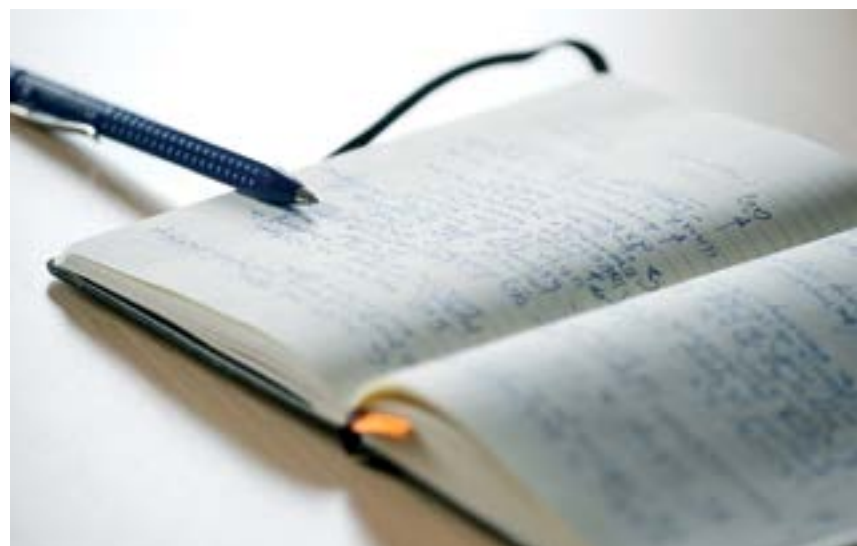
“Young pen” was born with the aim of bringing young Slovenian’s literature into publication.