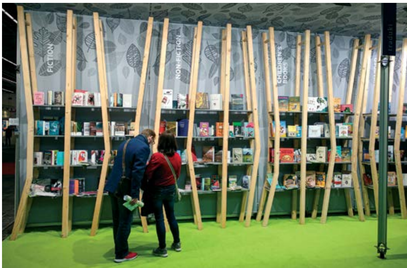
Slovenian National Stand at the Frankfurter Buchmesse 2022.

The project is being closely monitored and supported by the Ministry of Culture, with other ministries participating in the inter-ministerial group and contributing to the successful preparations. The Slovenian Tourist Board and its branch in Germany will also play a key role.