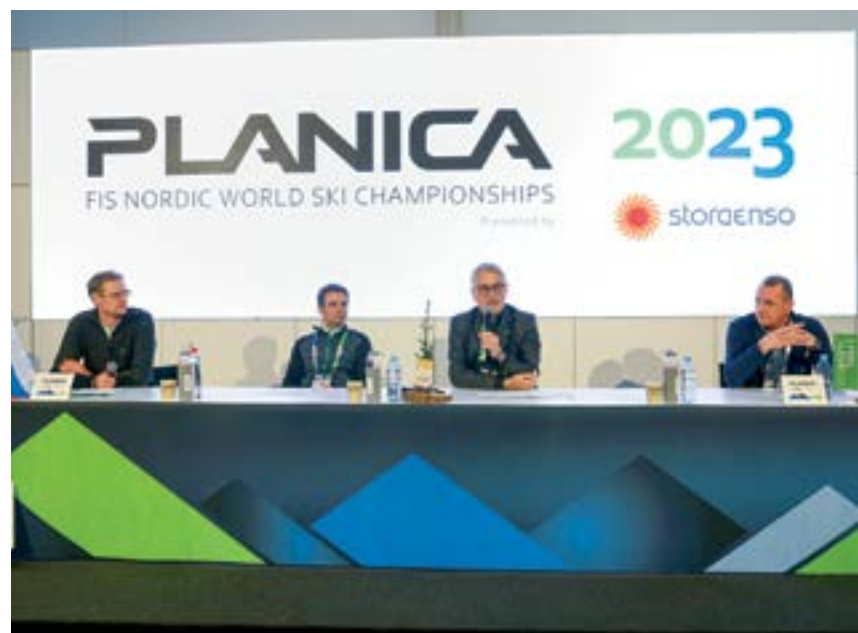
Slovenia can boast of an excellent infrastructure that follows sustainable principles.