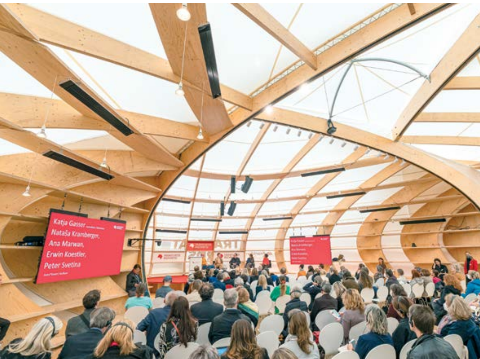
Press Conference at Frankfurter Buchmesse 2022 - Slovenia: Guest of Honour 2023 .