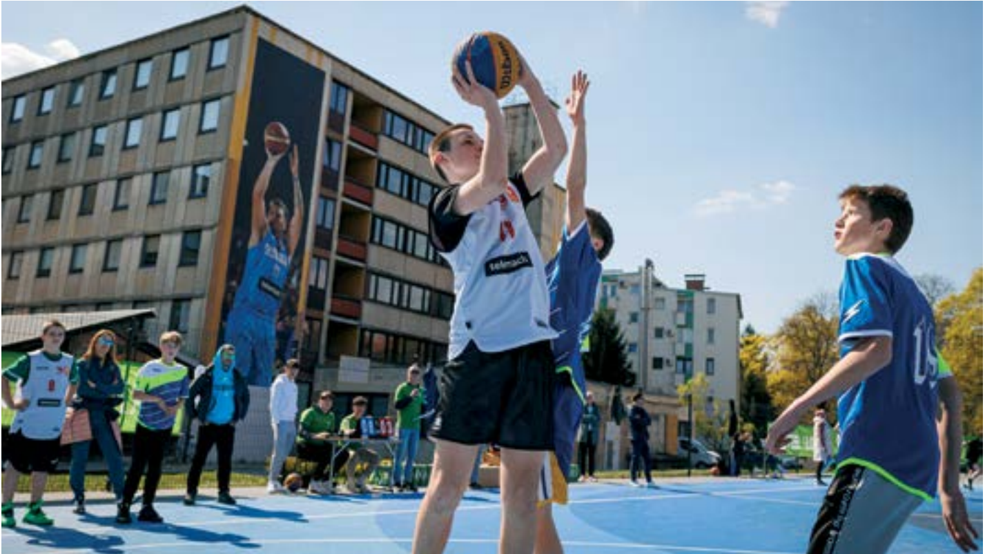
A race to win at the basketball playground in Celje.