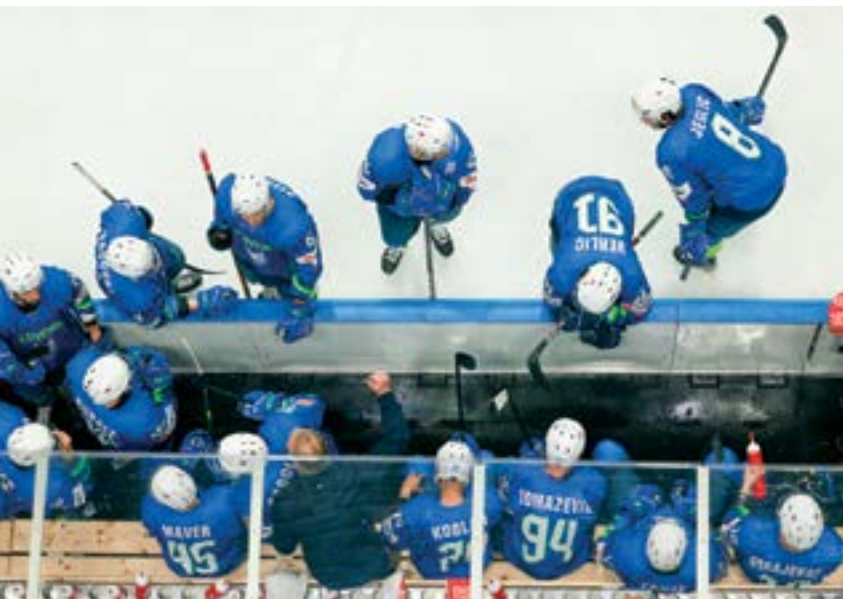
Slovenian ice hockey team will compete this year at the top division world championship.