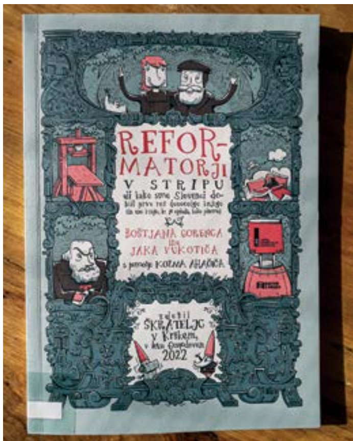
Reformatorji v stripu (in comics).

The comic shows us, in pictures and text, everything that a novel might only convey in many thousands of words.