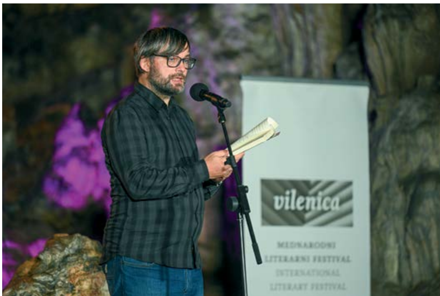
Literary festival in Vilenica is one of the Europe's most prominent festivals.

The Karst region is also home to Vilenica, which is not only another Karst cave, but is also known for its literary festival. Vilenica is certainly one of those festivals whose presence in literary circles is as permanent as the words of the authors who take part in it. Over the decades, Vilenica has become one of Europe's most prominent festivals, bringing together authors, translators, literary agents, publishers and, of course, readers from all over the world. Vilenica is a kind of crossroads of many creative paths - it encourages lively exchanges, new literary works, and at the same time enriches the local environment (Karst and Primorska).