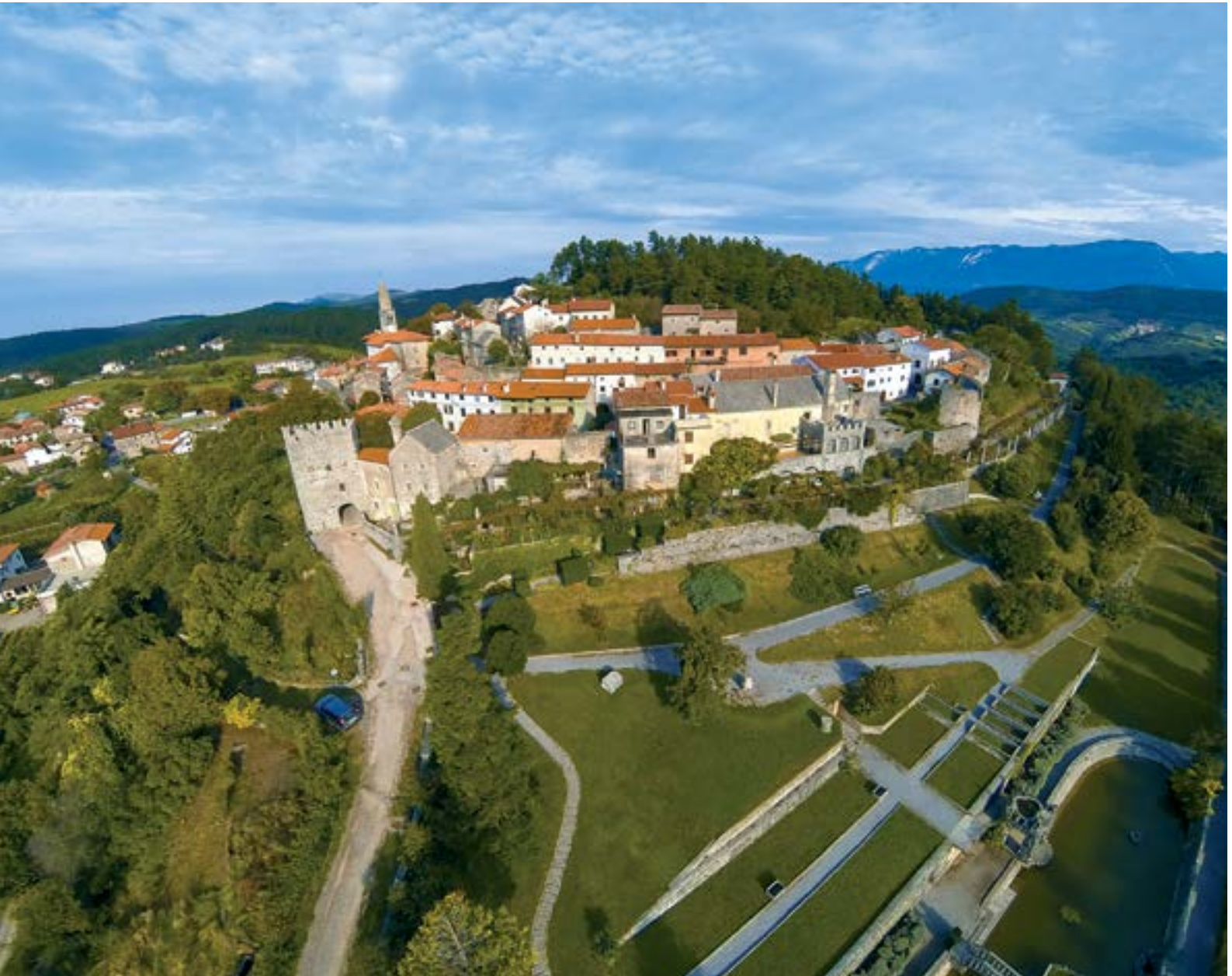
Štanjel at Kras.