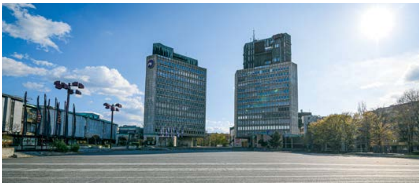
The three sided skyscrapers TR2 and TR3.