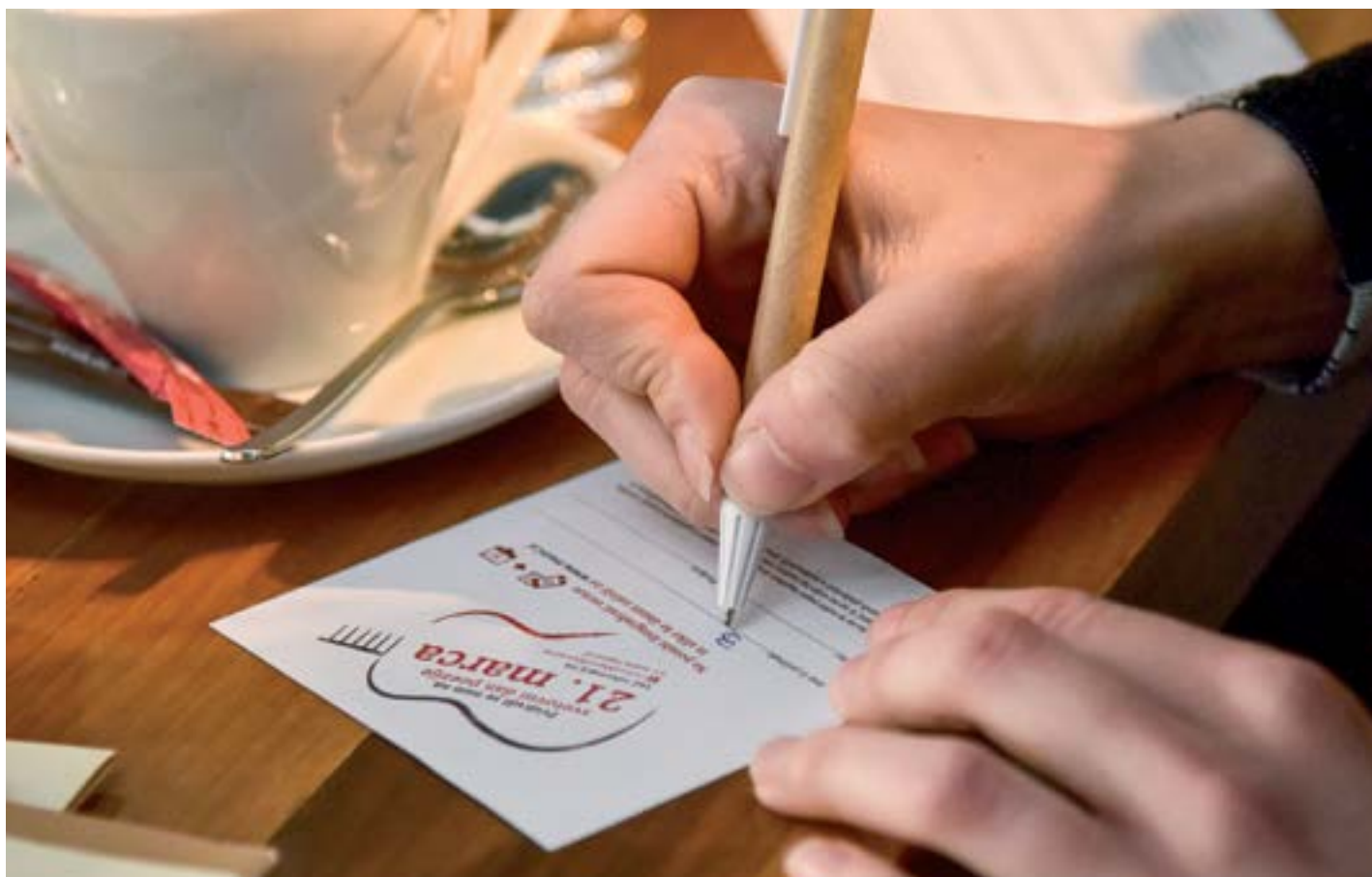
UNESCO first adopted 21 March as World Poetry Day during its 30th General Conference in Paris in 1999. Practiced throughout history, poetry includes various forms of language, expressions and signification. It is often accompanied by music and performed during special occasions. World Poetry Day celebrates one of humanity’s most treasured forms of cultural and linguistic expressions.