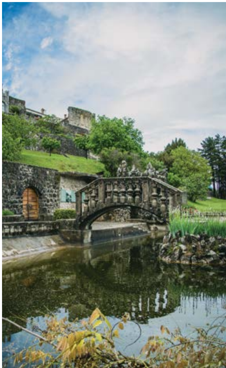
One of the most beautiful works of the architect Maks Fabiani is the Ferrari Garden in Štanjel.

One of the most beautiful works of Maks Fabiani, the greatest Slovenian architect after Jože Plečnik, is the Ferrari Garden in Štanjel.