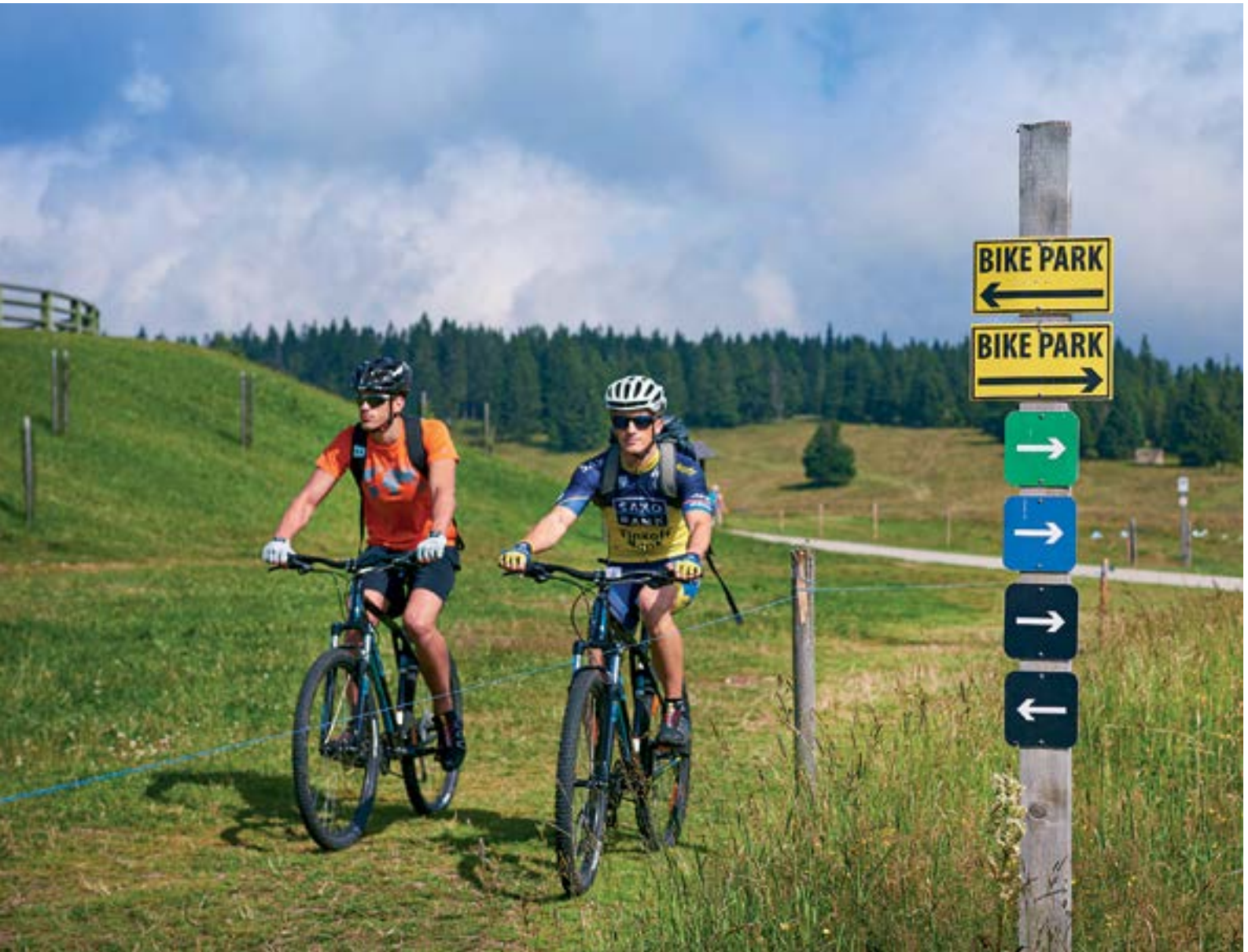
Slovenians value quality of life and like to spend it outdoors.