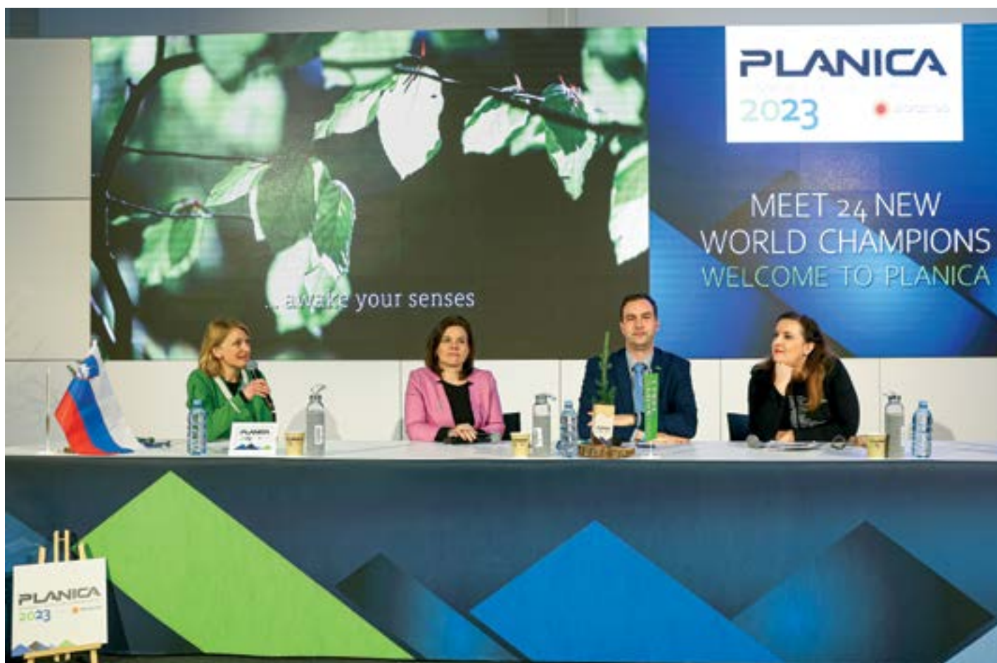
Slovenia presents itself at home and abroad with the national brand I feel Slovenia.

In Slovenia, sports are with us starting in early childhood.