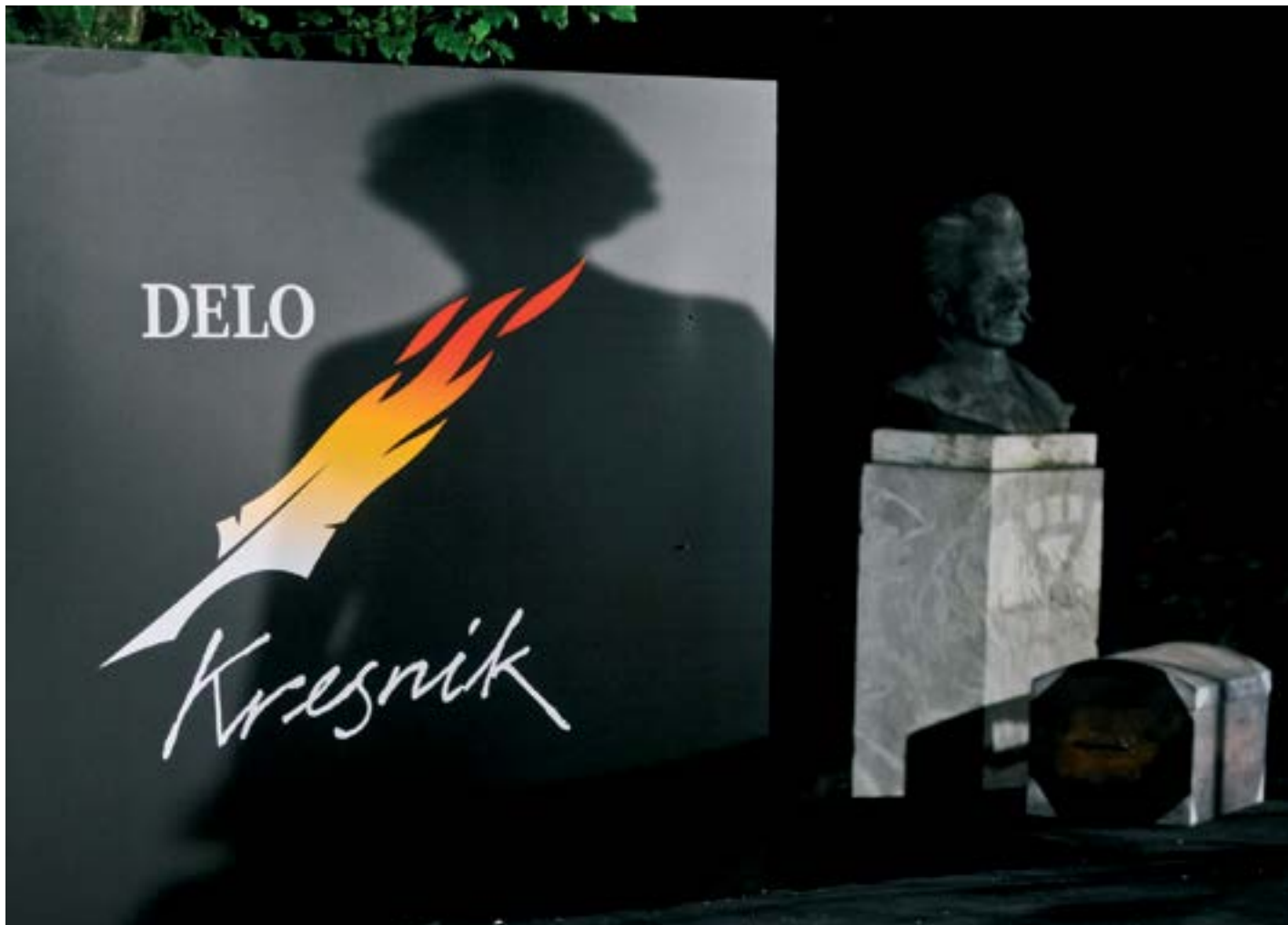
Since 1991, the Kresnik Prize, also known as the Kresnik Award, has been awarded by the newspaper Delo for the best Slovenian novel of the previous year. For the last few years, the award ceremony has been held at Rožnik above Ljubljana.