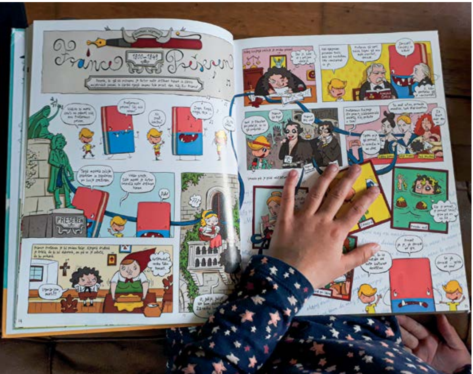
The authors present 30 names from Slovenian history (France Prešeren, Ivana Kobilica, Jože Plečnik, etc.).