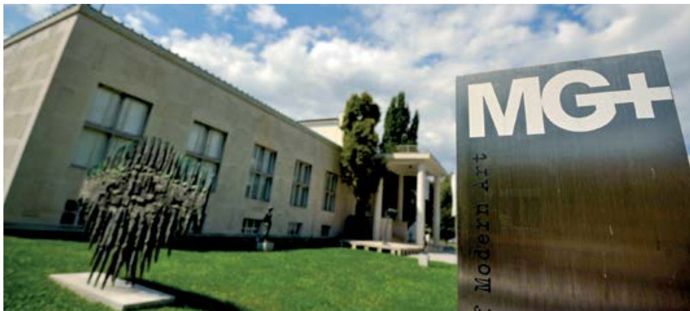
Gallery of Modern Art.