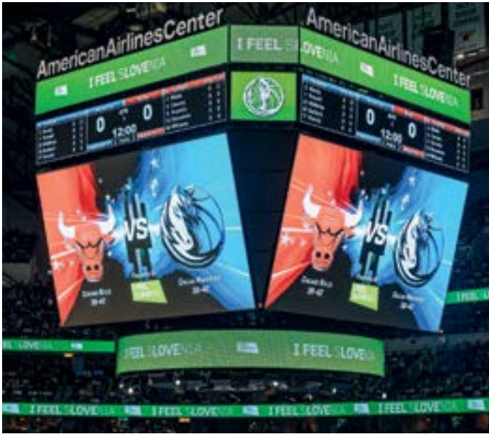
Chicago Bulls vs Dallas Mavericks.