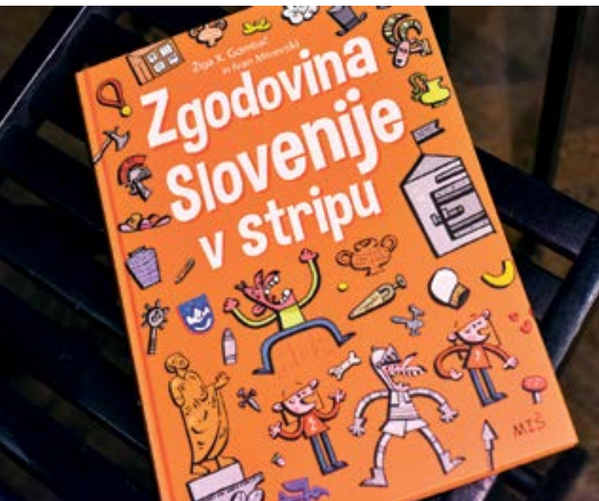
A presentation of Slovenian history through the comic strip.