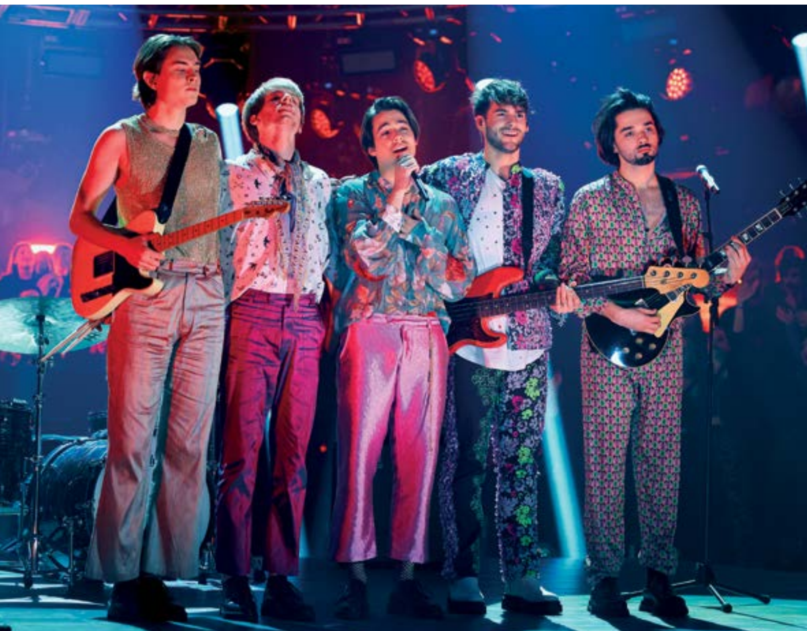
Joker Out - a young, dynamic and very popular band in Slovenia - will represent Slovenia at Eurovision Song Contest.