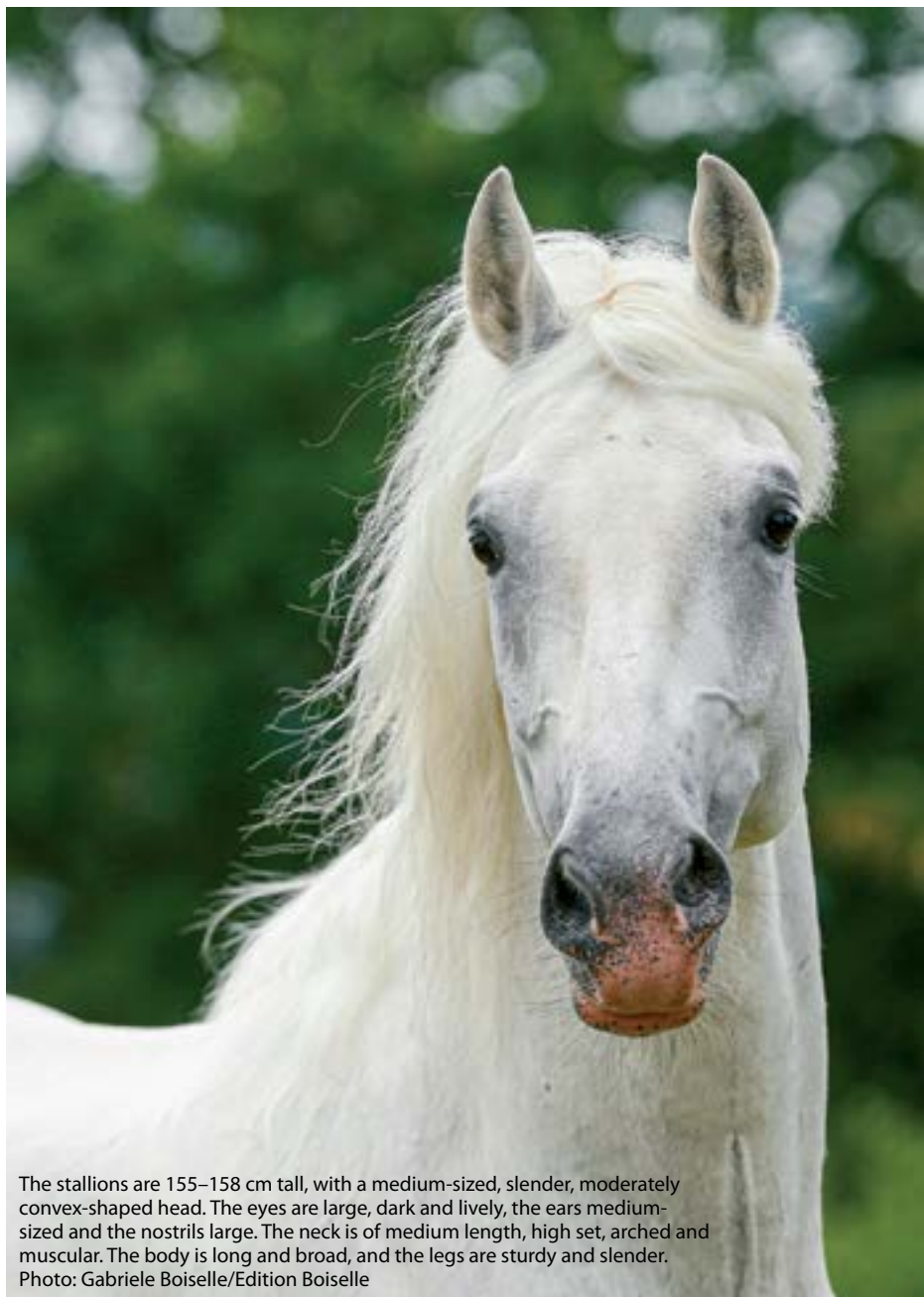
The stallions are 155–158 cm tall, with a medium-sized, slender, moderately convex-shaped head. The eyes are large, dark and lively, the ears medium-sized and the nostrils large. The neck is of medium length, high set, arched and muscular. The body is long and broad, and the legs are sturdy and slender.

Cultural heritage and tradition bind us together in a European context.