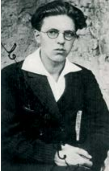
Poet Srečko Kosovel.