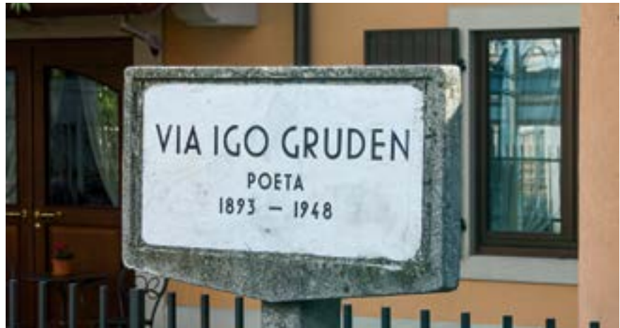
Igo Gruden's street in Basovizza.

Maks Fabiani (1865–1962) was born in Kobdilj in the Karst region. He was the first architect of his time to receive a doctorate in urban planning. University professor in Vienna, architect, landscape architect, painter, writer, innovator, humanist, traveller, politician and visionary.