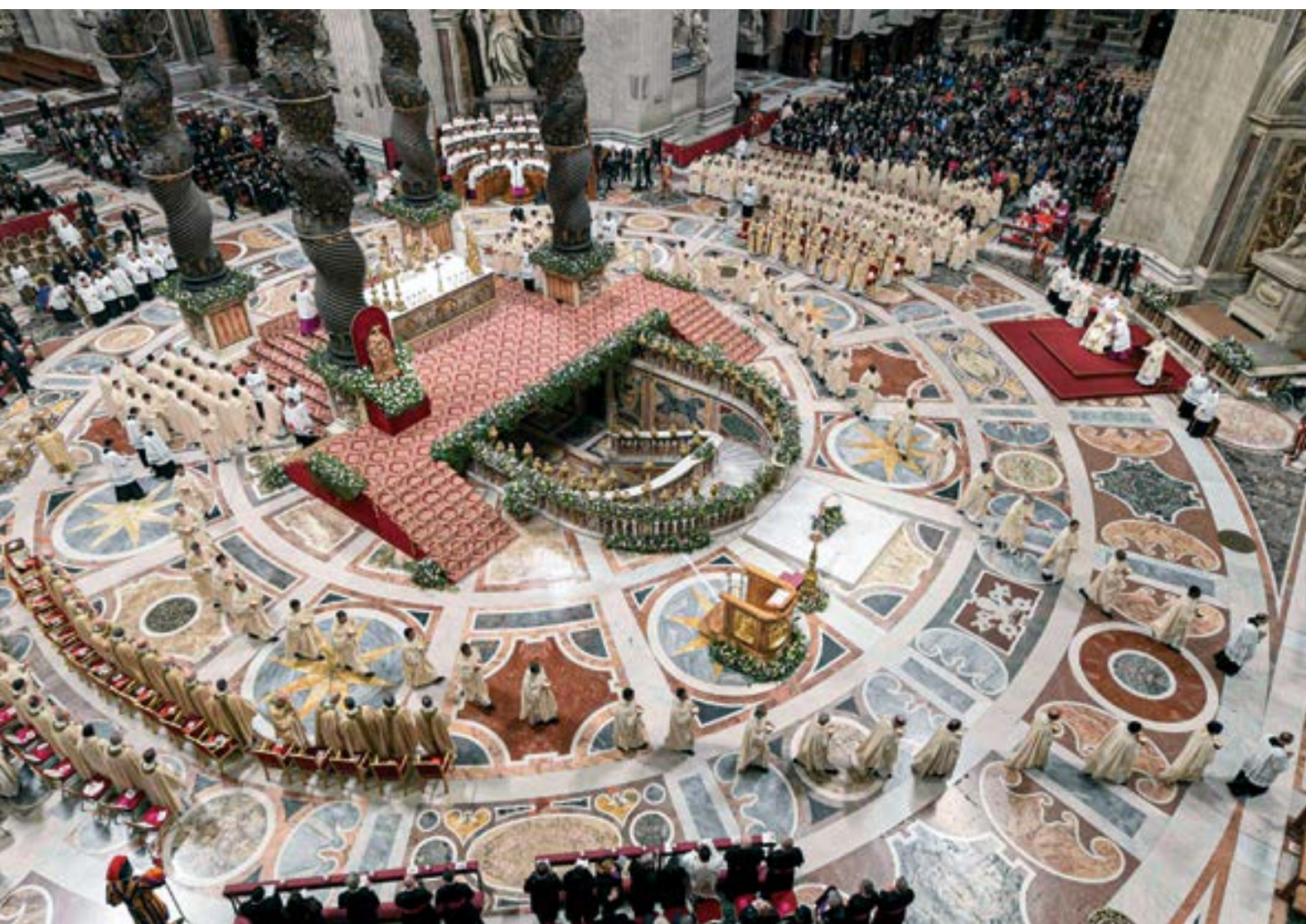
The final view at the altar in st. Peter's Basilica.