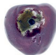
Spotted-wing drosophila ( Drosophila suzukii ): tiny ... but it can eat our delicious cherries and other soft fruit.