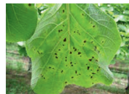
Bacterial canker of kiwifruit ( Pseudomonas syringae pv. actinidiae ): invisible ... but it can destroy our kiwifruit orchards.