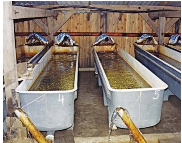
b) Circular tanks with automatic