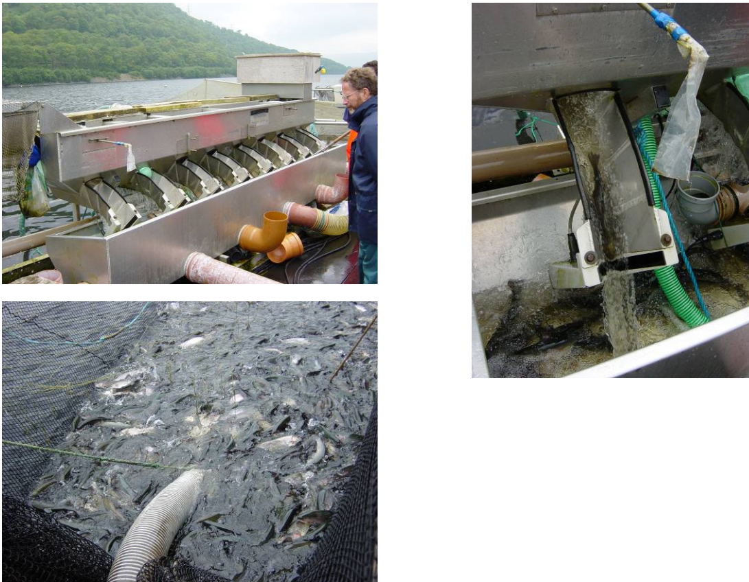
Figure 2. Ongrowers grading