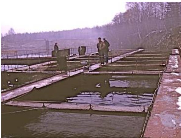
e) Freshwater cages for growers