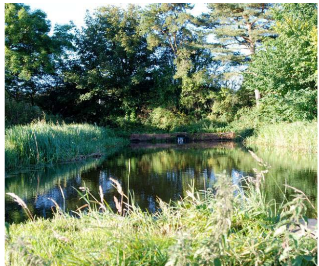
d) Earth pond for brown trout growers