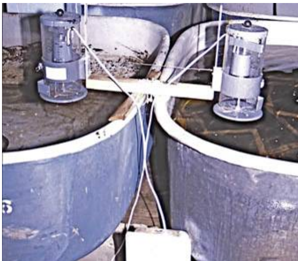
c) Circular tanks with automatic