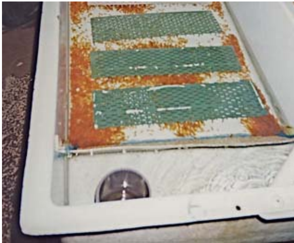
a) D-ended tank for fry or fingerlings