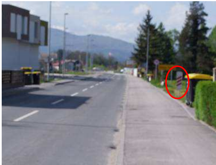
Figure 4: Presentation of visibility of road signs I-39: owing to the buildings and facilities located along the road, these signs are completely absorbed into their surroundings

Automatic protection is activated for train journeys on either the regular track or the neighbouring track. The operation is controlled at Brezovica station and at the Postojna Traffic Control Centre.