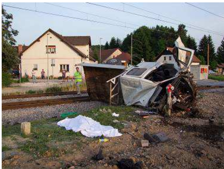
Figure 2: Consequences of collision of regional passenger train no. 2615 with road motor vehicle at Vnanje Gorice level crossing