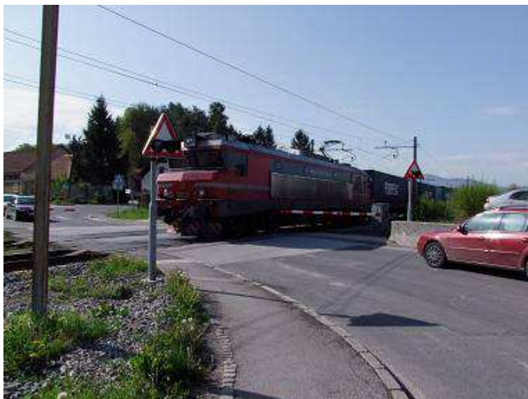
Figure 3: Display of level-crossing protection during the passage of trains

In particular during peak hours, road traffic is heavy at this level crossing. There is an average of 60 trains in both directions per day on workdays.