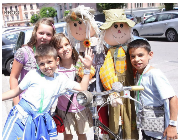
Children from Bosnia and Herzegovina receiving psychosocial rehabilitation in Slovenia (Institute Circle)

With the project My Community Ein El Helwah, Institute Circle is providing assistance to Palestinian and Syrian refugees in Lebanon, with particular emphasis on children and women. By providing training for young Palestinian and Syrian animators, group activities for various communities, psychosocial support for 200 Syrian and Palestinian female refugees and 200 children, the project helps enhance relations between different communities in the Ein El Helwah refugee centre, and thus the reintegration of refugees, as well as reducing tensions between the refugees and the host country.