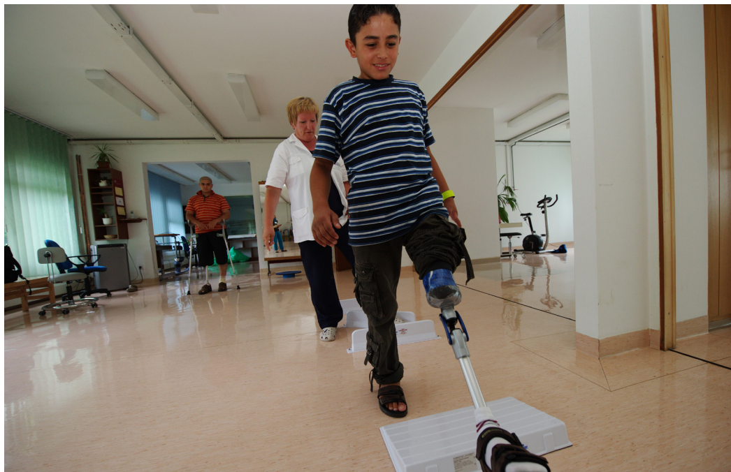
Rehabilitation of victim of the Gaza conflict at the Soča University Rehabilitation Institute