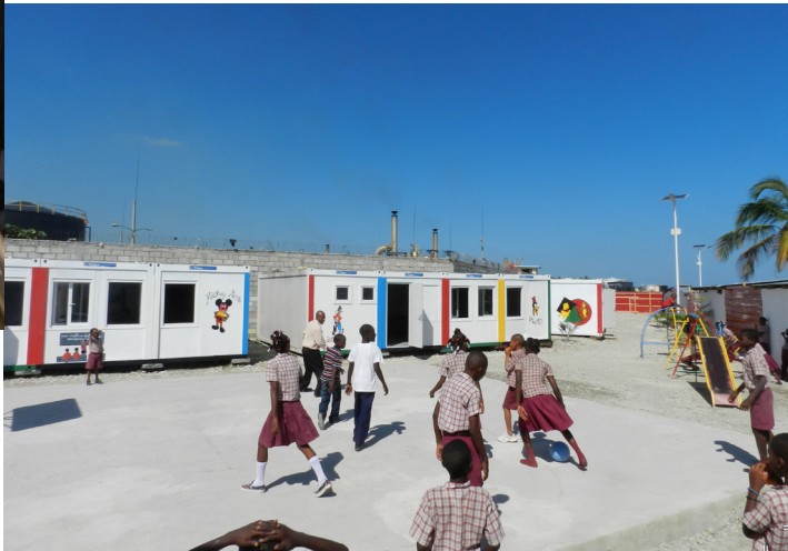
Slovenian school and playground in Haiti (IRD Global Institute)