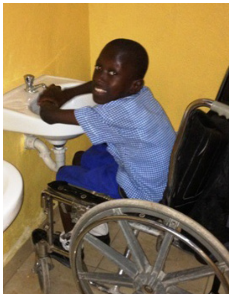
New orphanage for disabled children and provision of drinking water supply in Haiti (Caritas Slovenia)

hot meals for children and youth in the community where the Slovenian school was built. There is also a playground next to the school, which the children regard to be the best gift for them. IRD Global Institute also helped reconstruct a health care station, improving basic health care for children. Due to the difficult everyday situation and facing the loss of their closest relatives, the children have also been provided with psychosocial assistance. Slovenia thus ensured a comprehensive approach to the humanitarian crisis and helped satisfy the needs of the population also in the years following the earthquake.