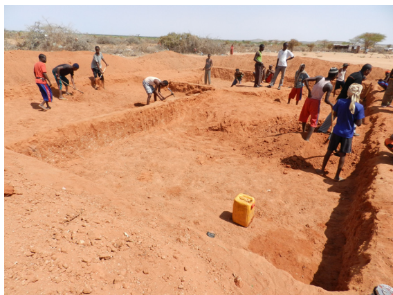
Building a well in Somalia (IRD Global Institute)

On a global scale, food security is increasingly threatened by the negative effects of climate change, such as droughts, floods, tsunamis, other extreme weather events, and protracted conflicts that result in an increasing number of displaced people. According to 2014 data provided by the WFP, more than 800 million people around the world suffer from hunger. The greatest challenge is presented by densely populated areas which are exposed to the negative effects of climate change, making them more vulnerable to natural disasters, and areas frequently affected by extreme droughts.