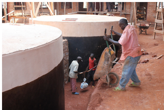
Building wells in North Burundi (Caritas Slovenia)

In 2012, the Slovenian NGO IRD Global Institute carried out the project Birked in Somalia to resolve difficulties with the water supply in villages of the Dolo district. The region faces drought seasons twice a year. If the amount of rain is not sufficient, the water supply may be interrupted. The project provided water for the local population, who have to walk for more than one hour to reach the nearest water source, and it also helped reduce migration as a result of the insufficient water supply. The building of a birked (village water tank/well), in which the local population freely participated, facilitated permanent access to water for the survival of 3000 residents in the Dolo district.