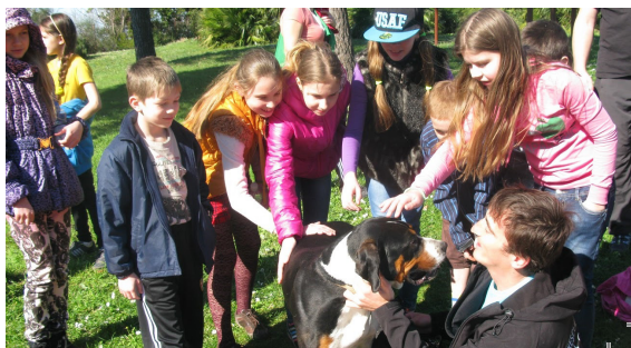
Medical rehabilitation of children from Belarus with the assistance of dogs (ITF;)

In 2014 and 2015, Slovenia supported the psychosocial rehabilitation of children from Ukraine who had been affected by the constant unrest in the country, traumatic events or the loss of their families. The Slovenian Red Cross and the ITF organised the arrival of 160 children in Slovenia to receive psychosocial rehabilitation. At Debeli Rtič, the children received various forms of rehabilitation and individual and group therapy, took part in sports, creative and social games, as well as received social pedagogical support. A pedagogical counsellor at the Debeli Rtič Youth Health and Holiday Centre addresses the issue of whether the effects of rehabilitation provided at Debeli Rtič fades after the children return home: “At a certain moment, we all need to believe that the situation can also be better. Here, the children have the chance to be what they are. When they return home, they are no longer the same and look at the world differently. They have experienced ten days of a real, carefree childhood, imagination, playfulness, joy, and happiness. This is minimal, but means a great deal.”