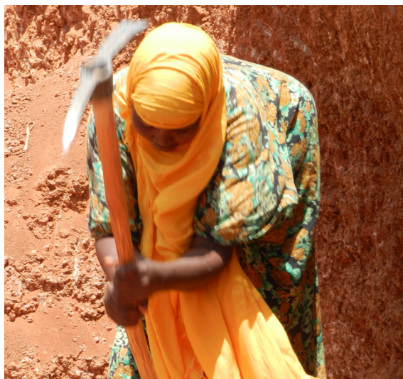
A Somali woman helps build a well

The needs for international humanitarian assistance, which is essentially aimed at saving lives, preventing and alleviating suffering and preserving dignity, are increasing, while the nature of crises requires measures entailing close cooperation of the entire international community. Slovenia provides international humanitarian assistance to affected countries according to their needs, thereby taking into account the