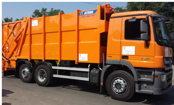
New refuse vehicle to help remove the debris after flooding in Serbia (CMSR)

In 2015, Caritas Slovenia, in cooperation with the national and diocesan Caritas of Bosnia and Herzegovina in Sarajevo, carried out a project to restore the health centre and fire station damaged by floods. Through the project, more than 800 villagers from Vidovice and the neighbouring villages were provided with adequate health care. Security in the event of fire or other disasters was also improved, since the voluntary fire brigade has regained adequate premises and possibilities for unhindered operation. "The greatness of a person is measured by their compassion and help to those in need," stated the president of the fire brigade at the opening of the fire station.