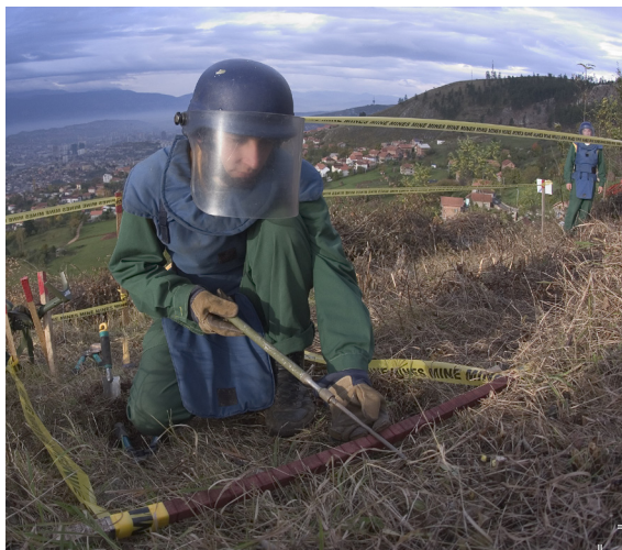
Manual demining (ITF; photo: Arne Hodalič)

Most demining projects led by ITF between 2010 and 2015 were carried out in South Eastern Europe, the Middle East and North Africa. In addition to demining, special attention must be devoted to mine risk education, mine victims assistance and capacity building. Mine risk education is intended especially for young people. At one of the training sessions for raising awareness of UXO-related risks, a boy from Bosnia and Herzegovina who had been wounded by a bomb said: "Areas with dense growth which have not been used for a long time are really dangerous, although it is very unlikely that they are still mine polluted. You may lose an arm, a leg or your life. Do not risk it. Be aware of the danger and be careful. You do not need to learn from your own mistakes, as I did."