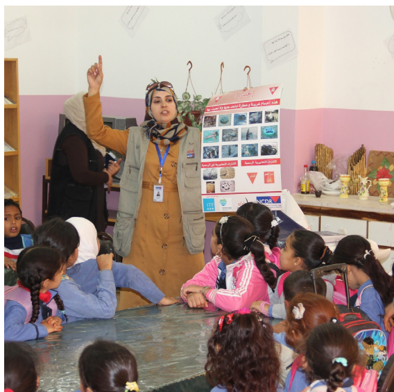
Mine risk education in Jordan (ITF)

In cooperation with other donors, Slovenia is also engaging in mine action. Wars leave behind extensive areas contaminated by unexploded ordnance (UXO). In the post-conflict period, efforts by numerous stakeholders to clear such UXO with a view to preventing numerous civilian victims are essential. Approx. 133.3 million square metres of mine-polluted areas have been cleared: 128 million square metres in countries of South Eastern Europe, 2.1 million in South Caucasus and 1.3 million in South Lebanon.