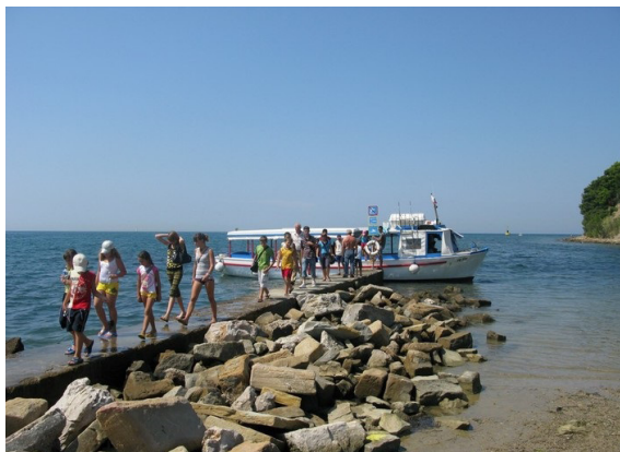
Rehabilitation of Ukrainian children in Debeli Rtič (Slovenian Red Cross)

The well-being of children is also at the core of assistance to refugees and displaced persons. The children of Syrian refugees in Jordan and Lebanon were provided assistance in the form of awareness-raising of mine risk and teaching assistance, and psychosocial support was provided to Palestinian and Syrian refugees in Lebanon, particularly women and children. In 2011 and 2012, Slovenia also supported a project for the economic reintegration for refugees returning to Afghanistan.