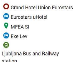
Venue, hotels and transportation map

Please note that participants bear the costs for their accommodation and are requested to make their own booking arrangements. However, the Ministry of Foreign and European Affairs of the Republic of Slovenia has negotiated exclusive room rates for the following hotels: Grand Hotel Union Eurostars, Eurostars uHotel, Exe Lev (Hotel). All hotels are located in the vicinity of the Conference venue, in the centre of Ljubljana, as marked on the map below.