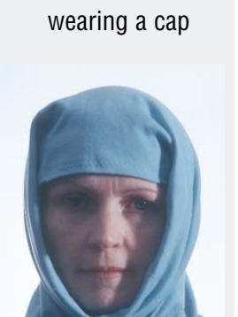
shadows across face