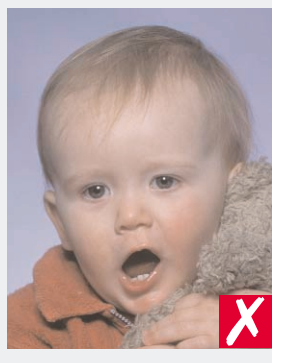
mouth open and toy too close to face