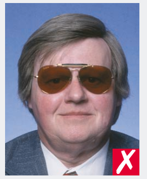
dark tinted lenses