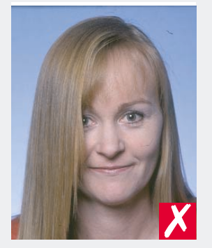
hair across eyes