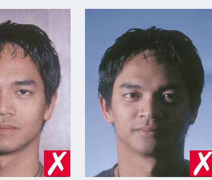
shadows behind head