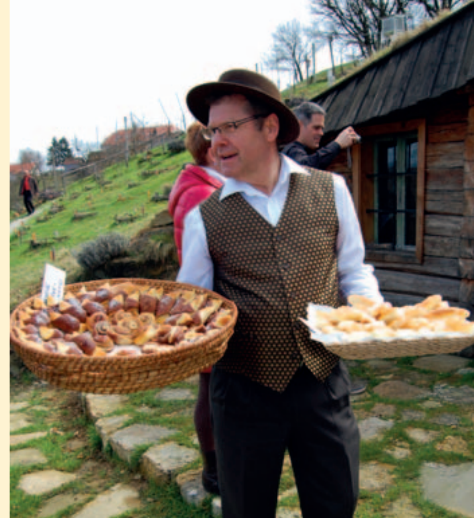
Honey & Herbs Gourmet Experience