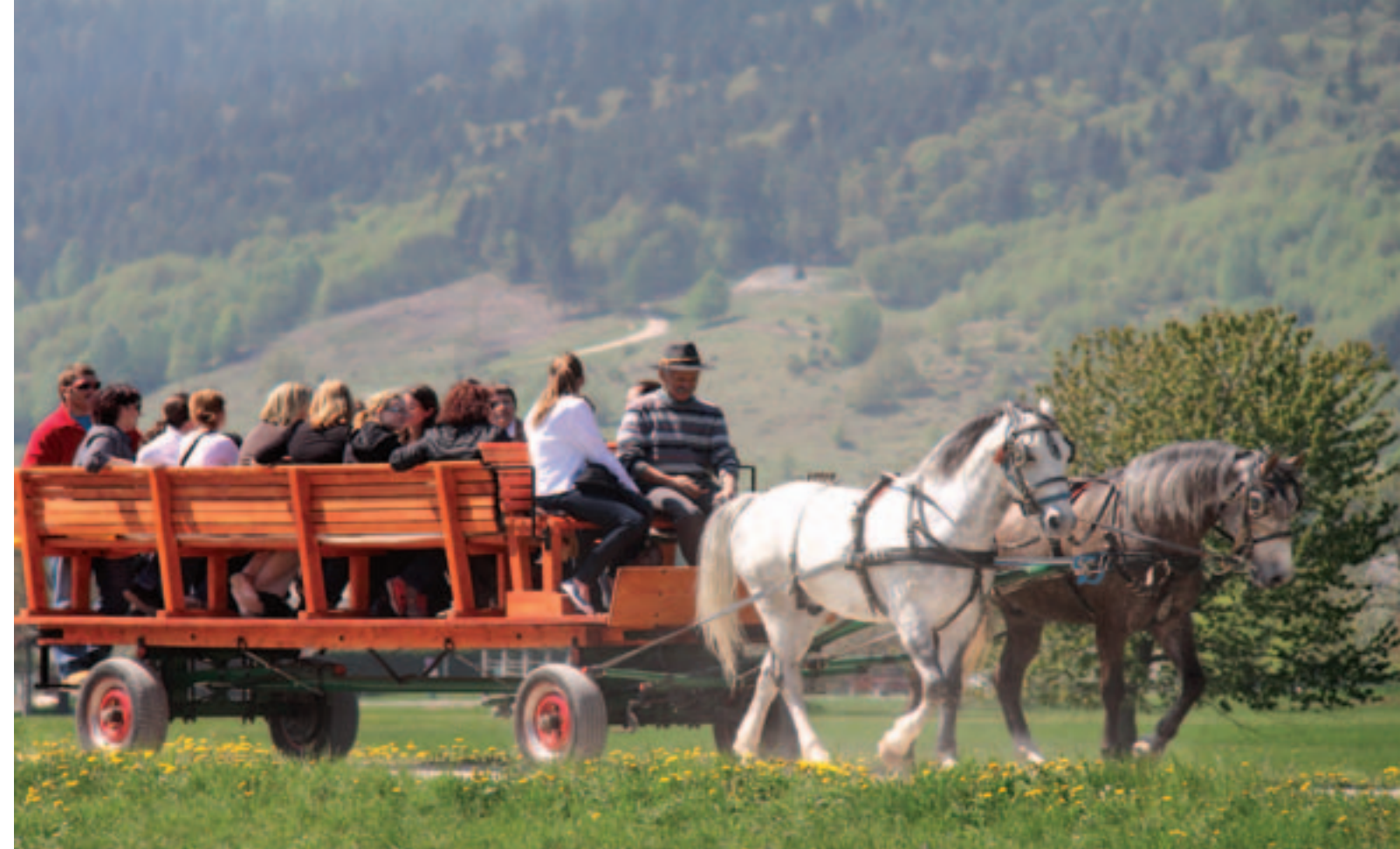
Žirovnica Institute of Tourism and Culture

Enter a verdant wilderness of sumptuous forests and crystal clear waters, rolling vineyarded hills, as well as natural thermal and mineral springs, offering almost limitless possibilities for health and relaxation in the midst unspoilt nature. This is a country of quality wine and excellent food, historic towns, castles, monasteries and hill-top churches, a land of hospitable people who will welcome you with open hearts and a smile.