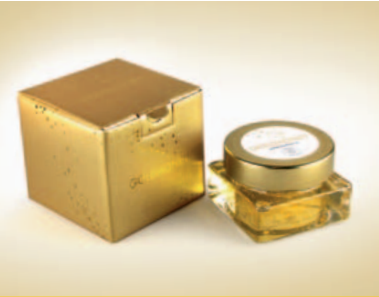
Božnar House of Honey