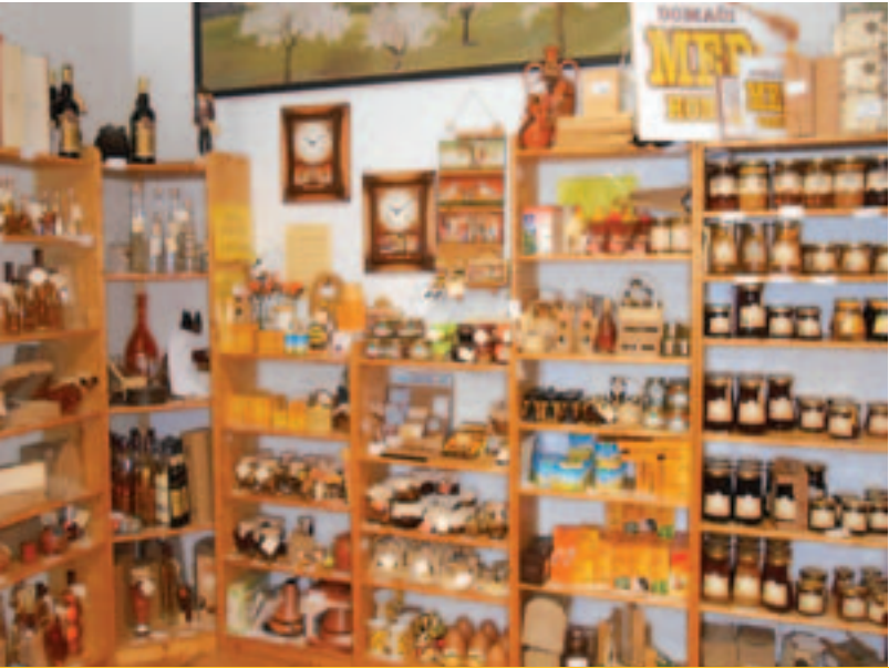
Maribor Beekeeping Center

WARNING: We strongly recommend the moderate consumption and use of all bee products. Those who suffer from diabetes should consult their physician in relation to understanding the possibility of side effects. Pollen, propolis and bee venom can induce allergic reactions.