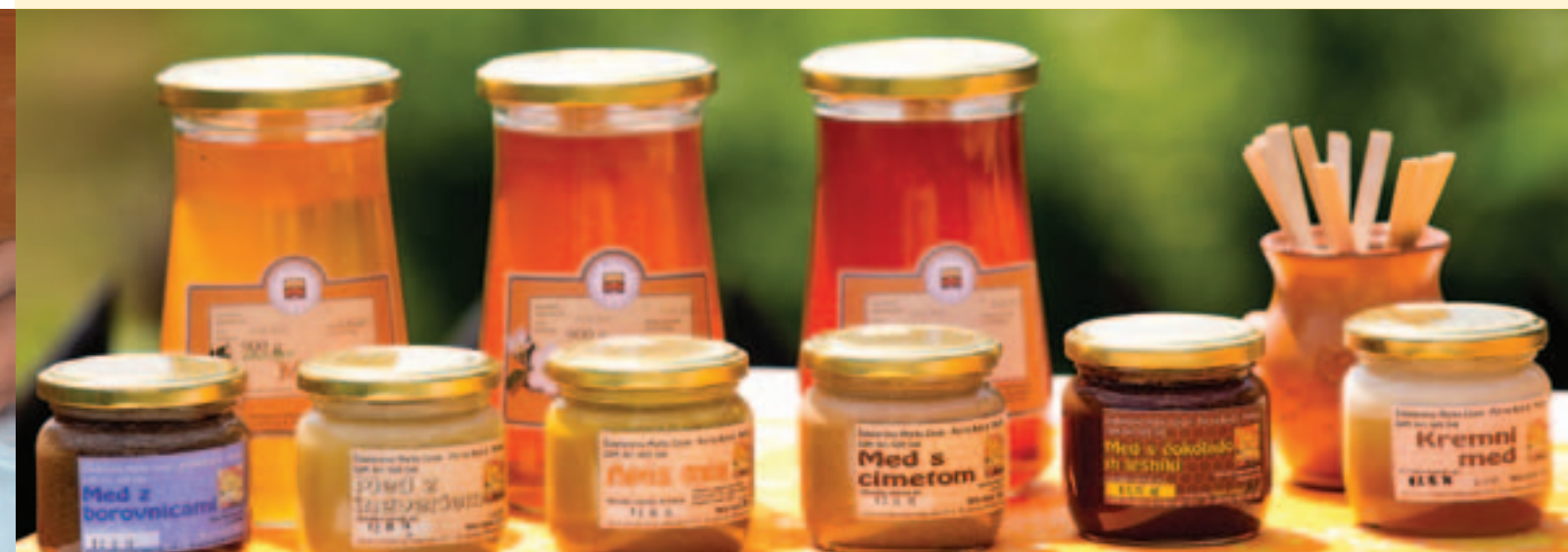
Wide Variety of High-Quality Honey