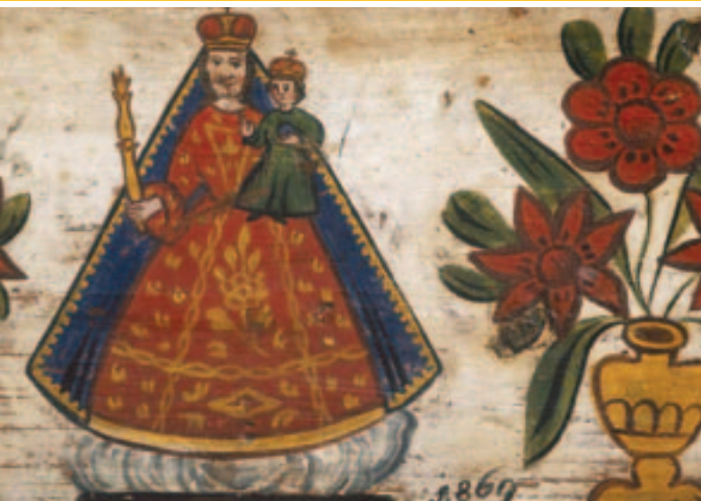
Museum of Apiculture, Radovljica

Travel for fulfilment, immerse yourself in nature and culture and realize the very best in your own life. Whichever form or meaning a travel experience may have for you, ApiRoutes ensures that you shall return home happy, more aware and with new knowledge or even philosophy. In short: it's all about people - and what we make of our lives in the context of our families and friends as well as responsibilities to generations yet unborn. Understanding and respecting natural patterns and living in harmony with nature, establishes a healthy basis for developing ourselves and indeed society as a whole.