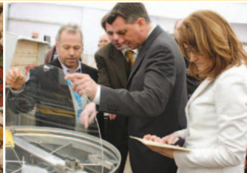
KIPGO, Beekeeping Equipment