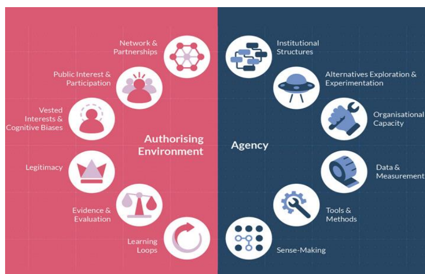
Figure 3 Governance mechanisms in the Anticipatory Innovation Governance model

The AIG working model focuses on how to bring anticipatory innovation elements into two key components of governance systems: agency and authorising environment. Both the agency and authorising environment have influence over all types of innovation activities across a public sector system and can thereby either spur or hinder innovation of this type (see Figure 3) (Tõnurist & Hanson, 2020). Applying an anticipatory innovation lens to these components requires governments to experiment with a number of different governance mechanisms for innovation to flourish and achieve value for the present and future.