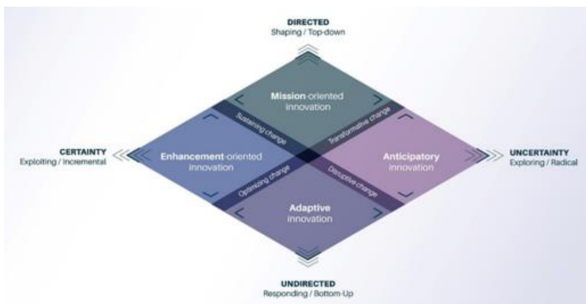
Figure 2 OPSI's Innovation Facets Model

Many governments excel in the areas of enhancement-oriented innovation and adaptive innovation . These types of innovation often operate in more certain environments and are frequently driven from the individual level by people who are willing and supported to pilot new ideas and approaches. Both adaptive and enhancement-oriented innovation generally demand less risk-appetite and can be built on small wins, as solutions are tested and scaled within teams and may subsequently be scaled across organisational and system levels.