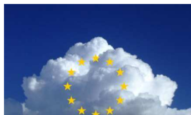
European Open Science Cloud