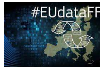
European Free Flow of Data initiative