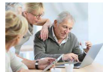
Silver Economy initiative