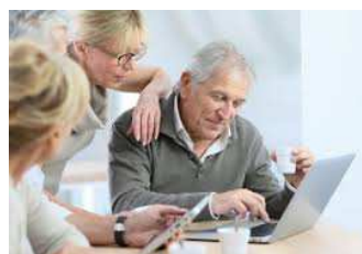
Silver Economy initiative