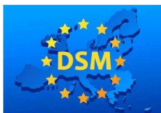
Connected Digital Single Market