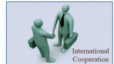
Beijing Software Enterprise Advisory Center