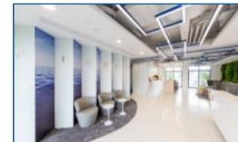
Shanghai Finland-China Innovation Center