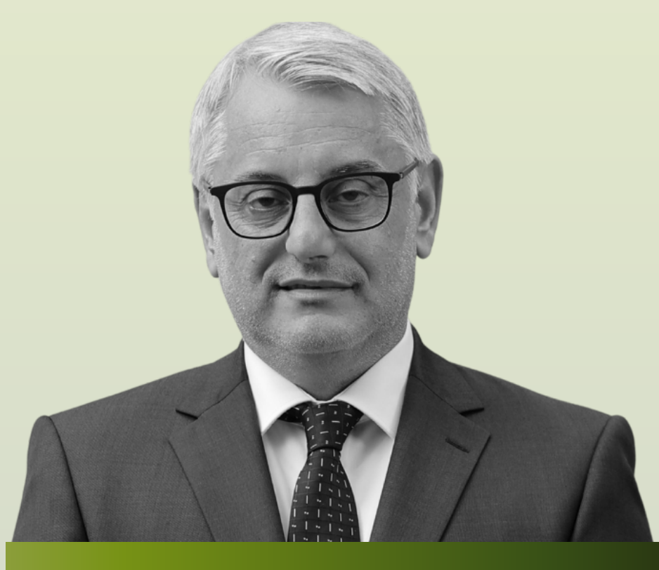
Matjaž Han, Minister for Economy, Tourism and Sports of the Republic of Slovenia