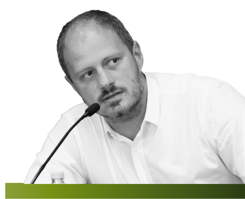
Radoslav »Rasho« Nesterović, Secretary General, Basketball Federation of Slovenia