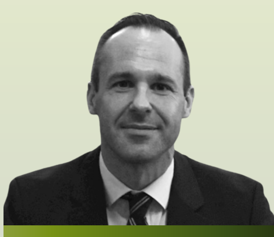
Andrej Medica, Minister Plenipotentiary - Chargé d'Affaires a.i., Embassy of the Republic of Slovenia in the USA