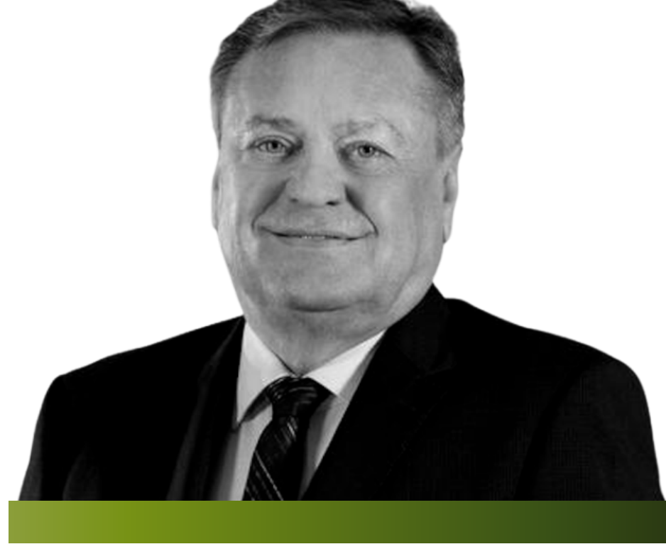
Zoran Janković, the Mayor of Ljubljana