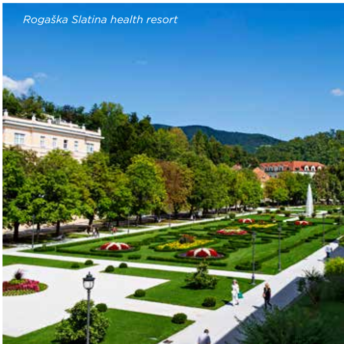
Rogaška Slatina health resort